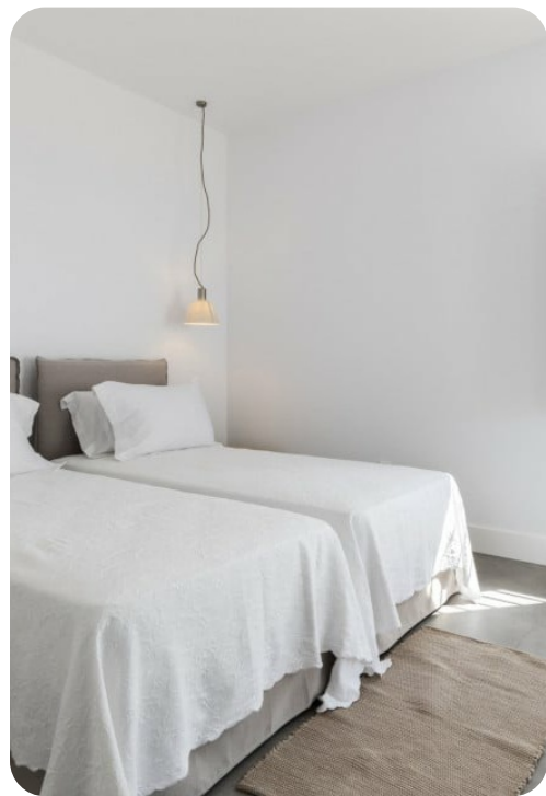
Templo y Mar | Page 3 of 6