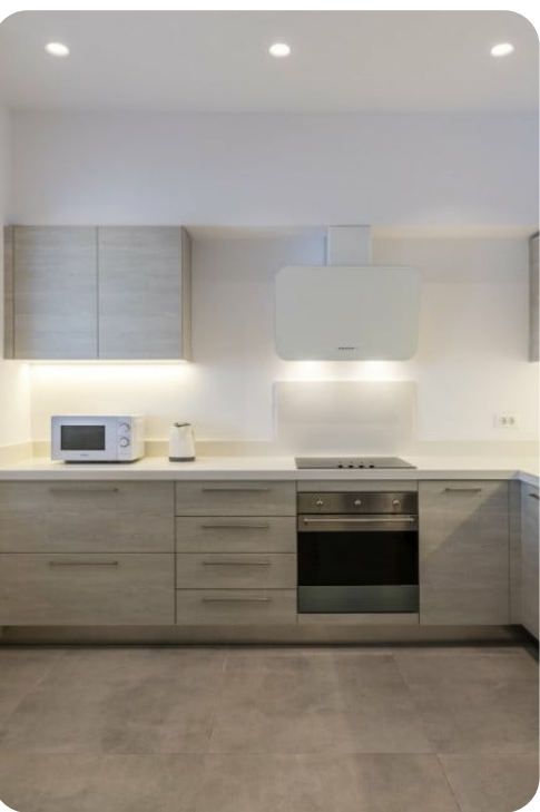
Templo y Mar | Page 2 of 6