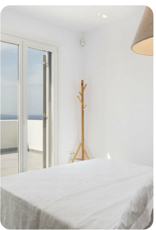
Templo y Mar | Page 4 of 6