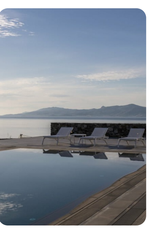
Templo y Mar | Page 5 of 6