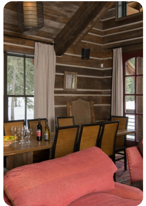
Taos Ski Valley 7 | Page 2 of 8