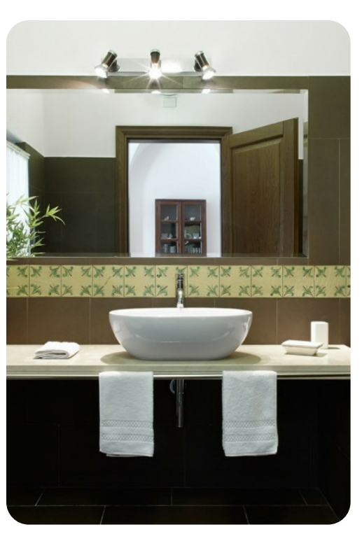
Tangeri | Page 4 of 7