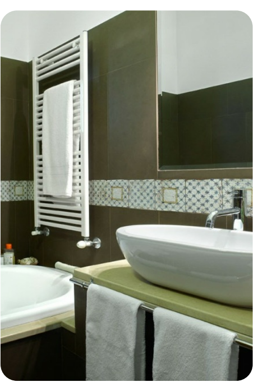
Tangeri | Page 5 of 7