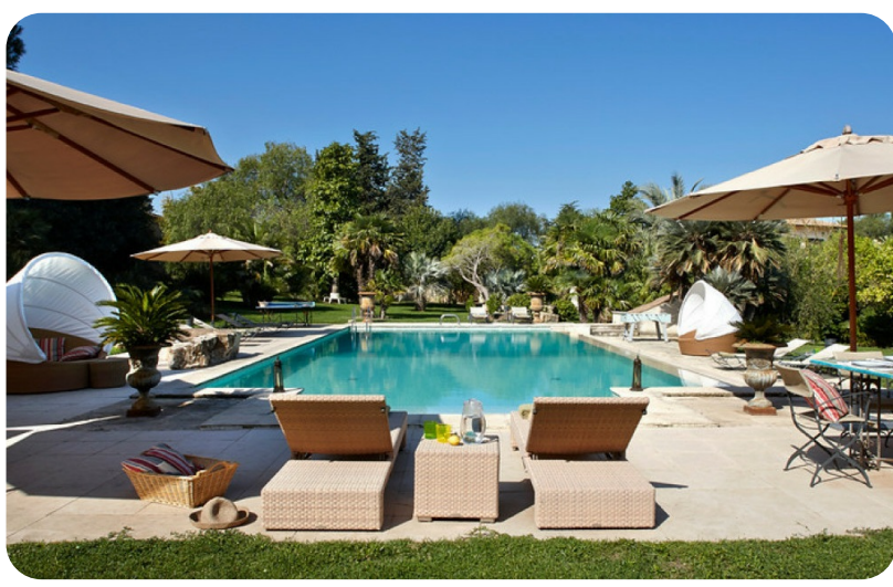
Tangeri | Page 1 of 7