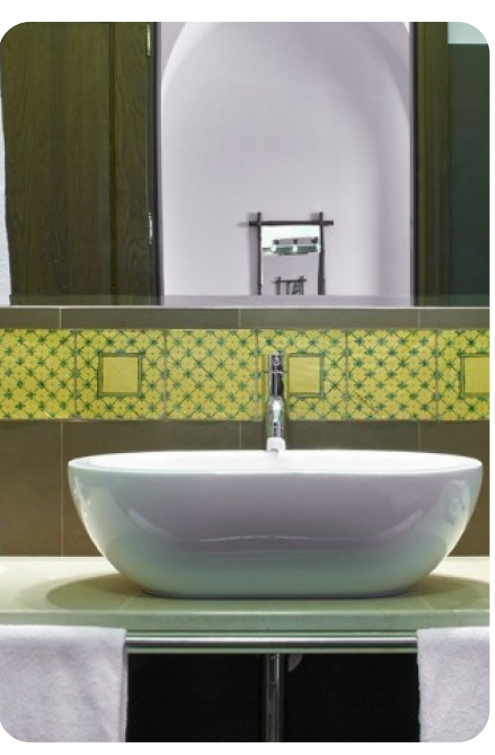
Tangeri | Page 6 of 7