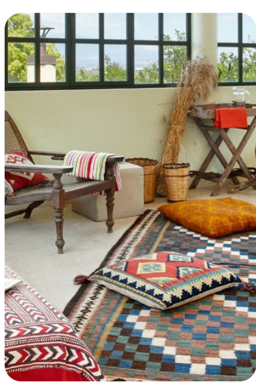
Tangeri | Page 2 of 7