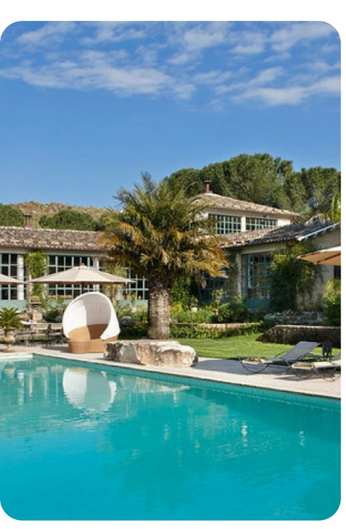
Tangeri | Page 7 of 7