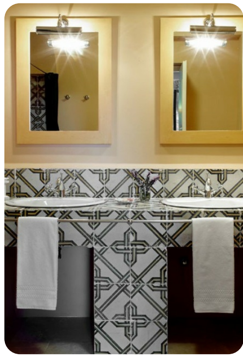
Tangeri | Page 3 of 7