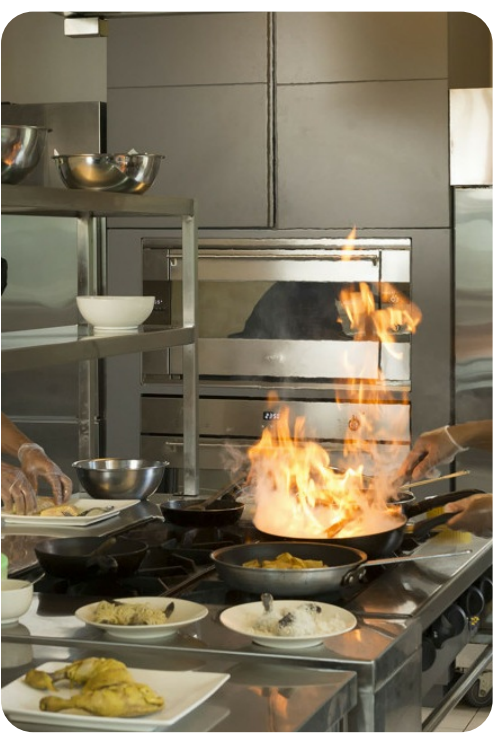
Tabanan 8723 - Kaba Kaba Estate | Page 8 of 8