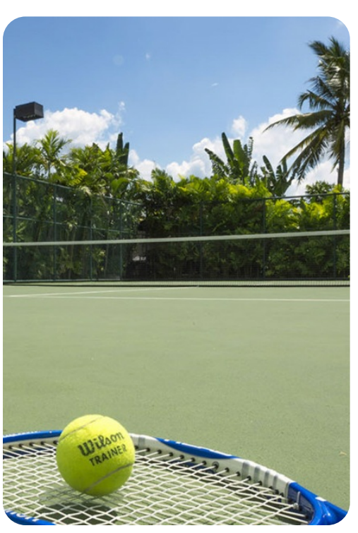
Tabanan 8723 - Kaba Kaba Estate | Page 5 of 8