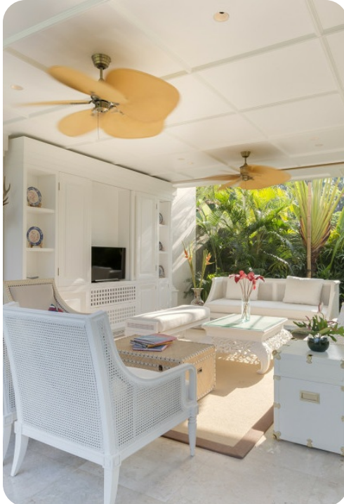
Tabanan 8723 - Kaba Kaba Estate | Page 4 of 8