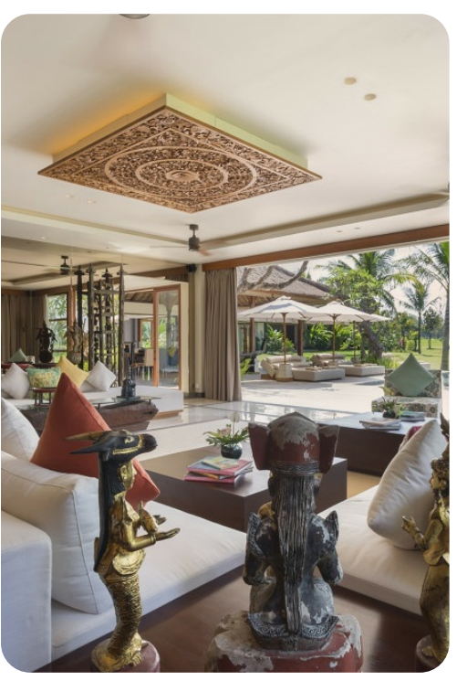
Tabanan 8723 - Kaba Kaba Estate | Page 7 of 8