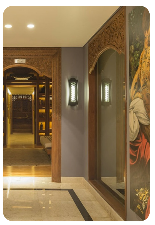
Tabanan 8723 - Kaba Kaba Estate | Page 3 of 8