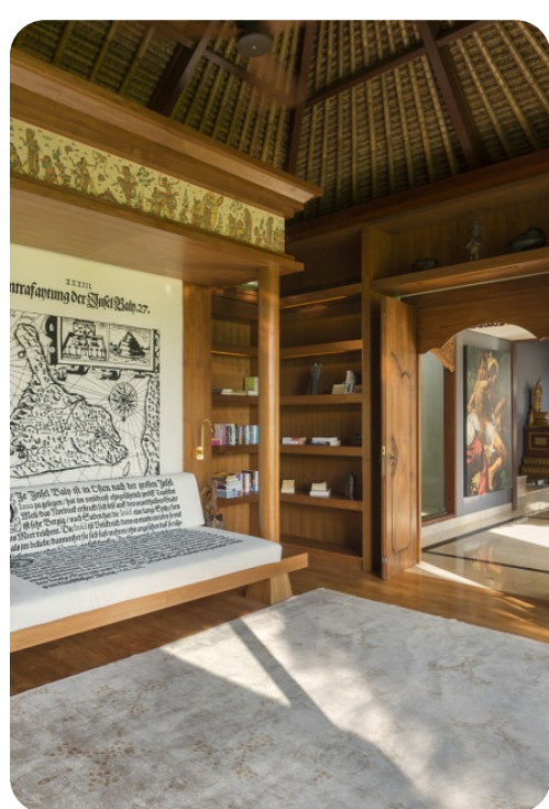
Tabanan 8723 - Kaba Kaba Estate | Page 2 of 8