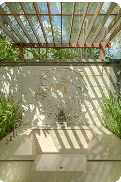
Tabanan 8723 - Kaba Kaba Estate | Page 6 of 8