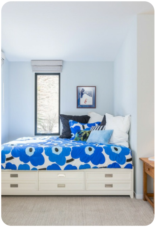
Sun Valley 60 | Page 7 of 8