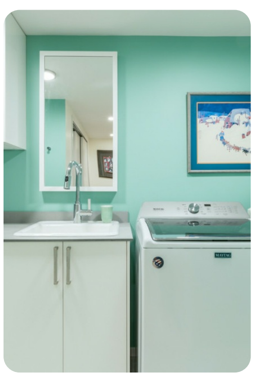
Sun Valley 60 | Page 8 of 8