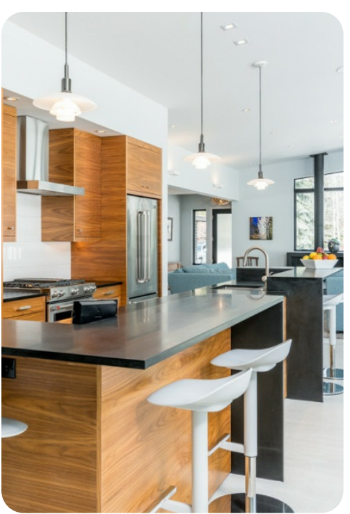
Sun Valley 60 | Page 4 of 8