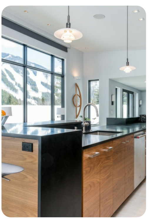
Sun Valley 60 | Page 2 of 8