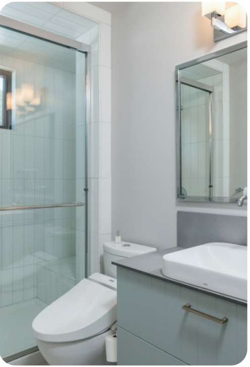
Sun Valley 60 | Page 5 of 8