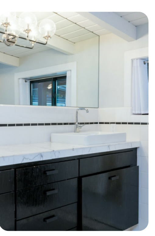
Sun Valley 60 | Page 6 of 8