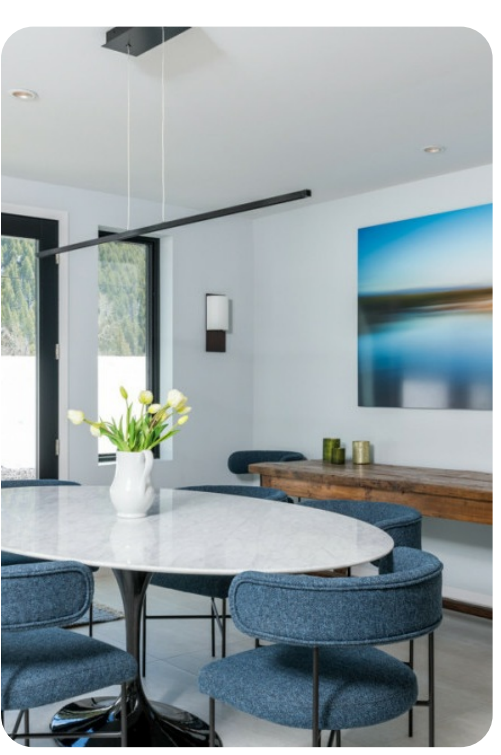
Sun Valley 60 | Page 3 of 8