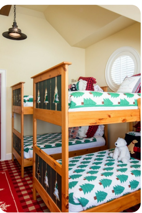
Sun Valley 43 | Page 8 of 8