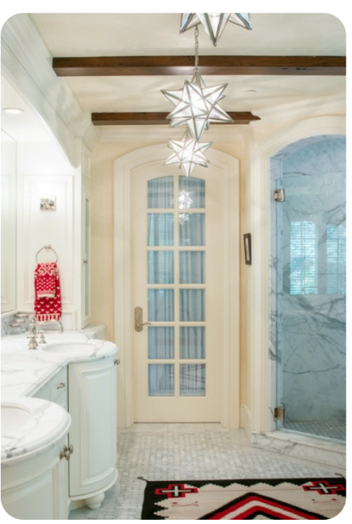
Sun Valley 43 | Page 5 of 8