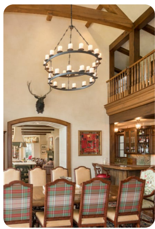
Sun Valley 43 | Page 2 of 8