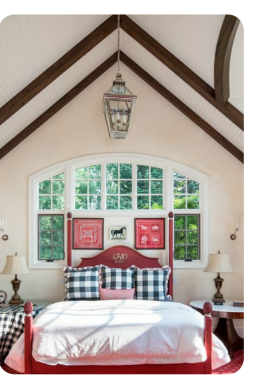
Sun Valley 43 | Page 4 of 8