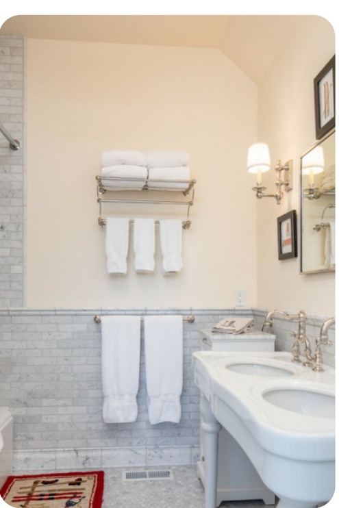
Sun Valley 43 | Page 6 of 8