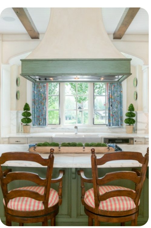
Sun Valley 43 | Page 3 of 8