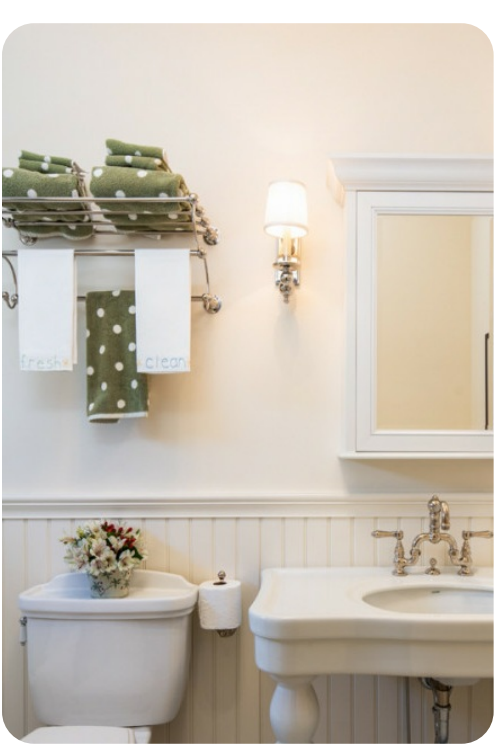
Sun Valley 43 | Page 7 of 8