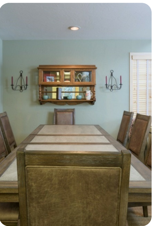
Sun Valley 28 | Page 2 of 5