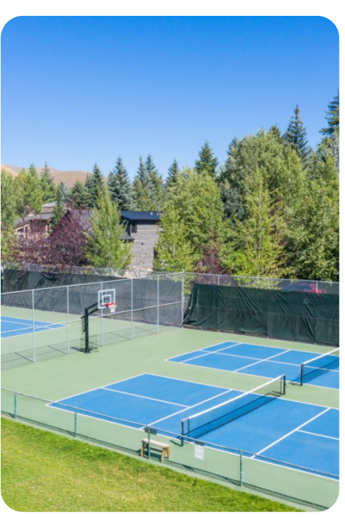
Sun Valley 28 | Page 4 of 5