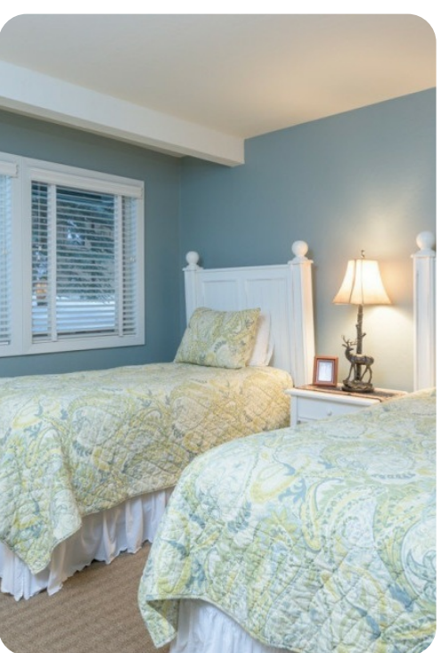
Sun Valley 28 | Page 3 of 5