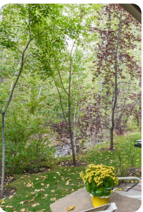
Sun Valley 24 | Page 5 of 6