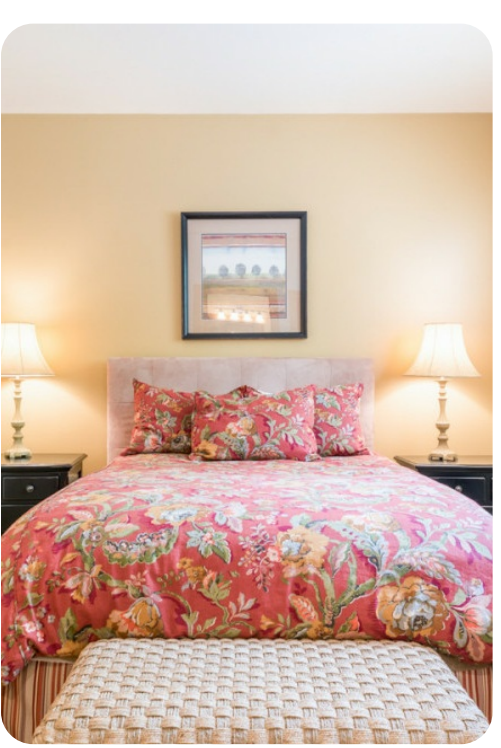
Sun Valley 24 | Page 3 of 6