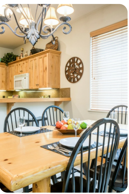
Sun Valley 24 | Page 2 of 6