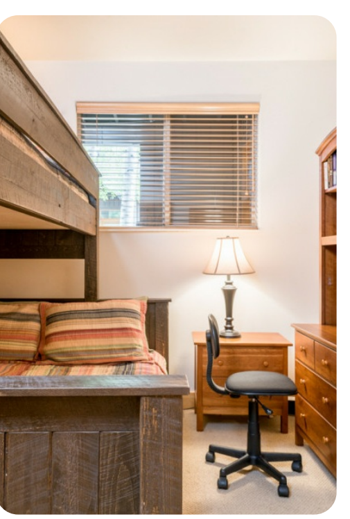
Sun Valley 24 | Page 4 of 6