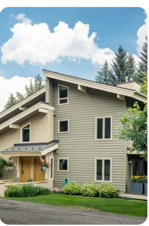
Sun Valley 1 | Page 7 of 7