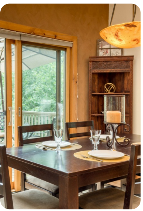
Sun Valley 1 | Page 3 of 7