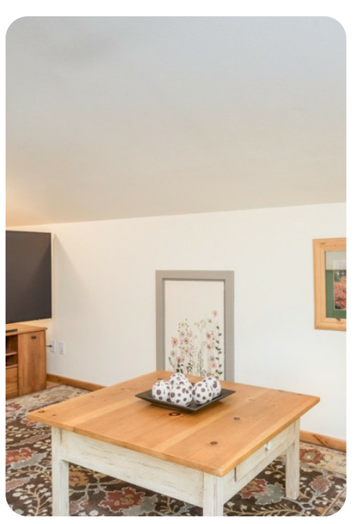
Sun Valley 1 | Page 5 of 7