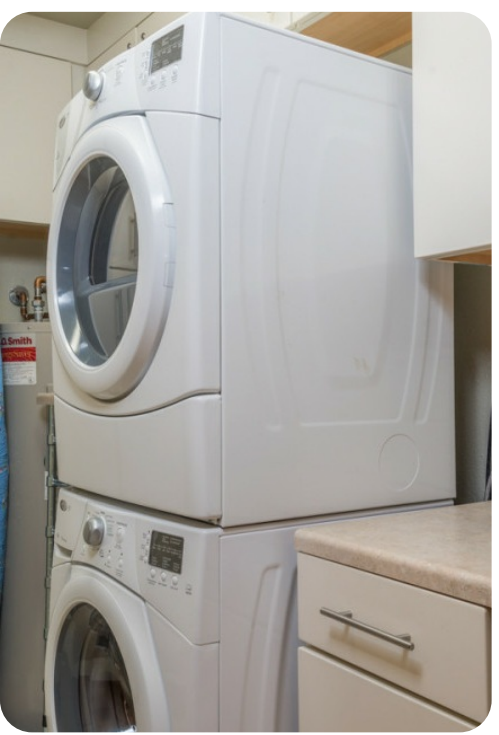
Sun Valley 1 | Page 6 of 7