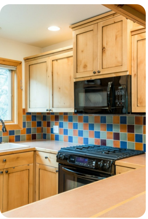
Sun Valley 1 | Page 2 of 7