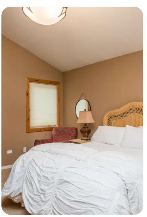
Sun Valley 1 | Page 4 of 7