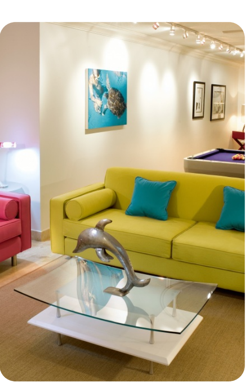
Sugar Hill - Bananaquit | Page 2 of 5