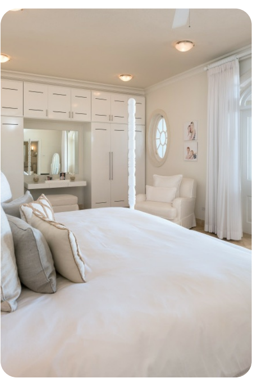
Sugar Hill - Bananaquit | Page 3 of 5