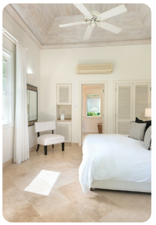
Sugar Hill - Bananaquit | Page 4 of 5