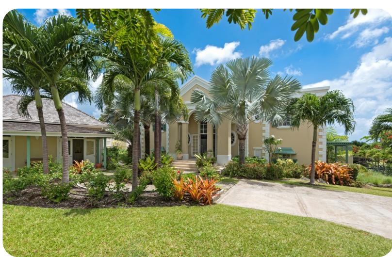
Sugar Hill - Bananaquit | Page 1 of 5