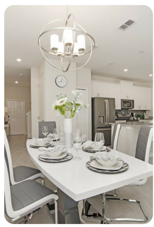
Storey Lake Resort 270 | Page 3 of 8