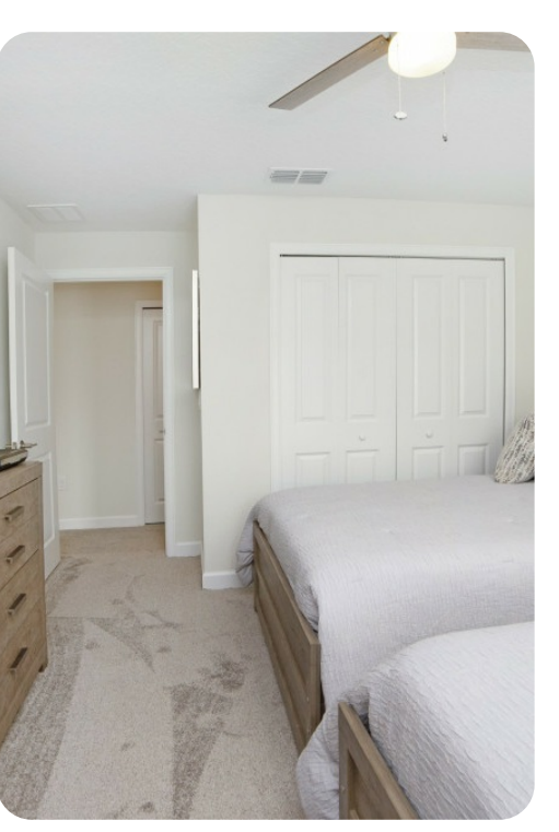
Storey Lake Resort 270 | Page 7 of 8