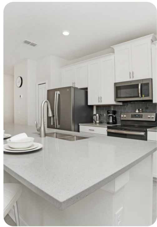
Storey Lake Resort 270 | Page 4 of 8