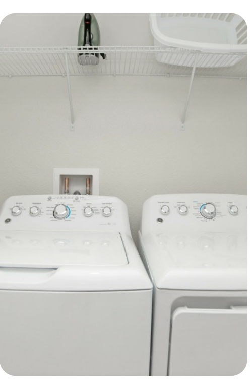
Storey Lake Resort 270 | Page 8 of 8