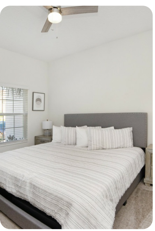
Storey Lake Resort 270 | Page 5 of 8