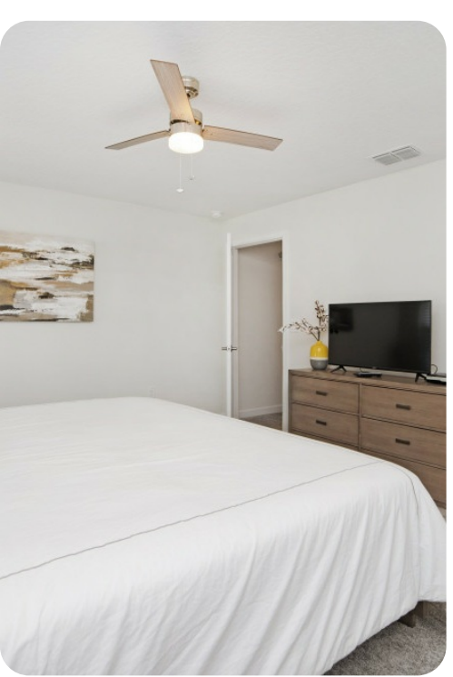
Storey Lake Resort 270 | Page 6 of 8