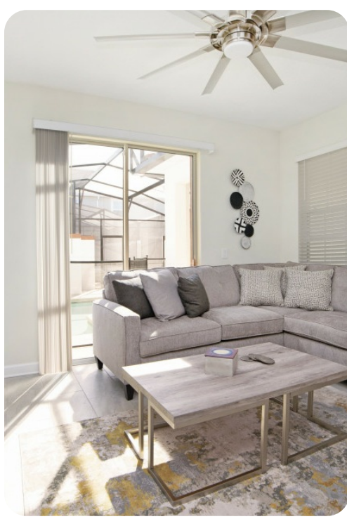
Storey Lake Resort 270 | Page 2 of 8