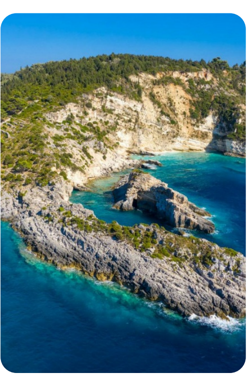
Spiros Jetty House | Page 5 of 6