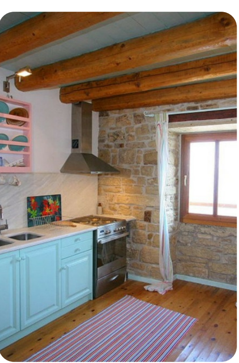
Spiros Jetty House | Page 2 of 6