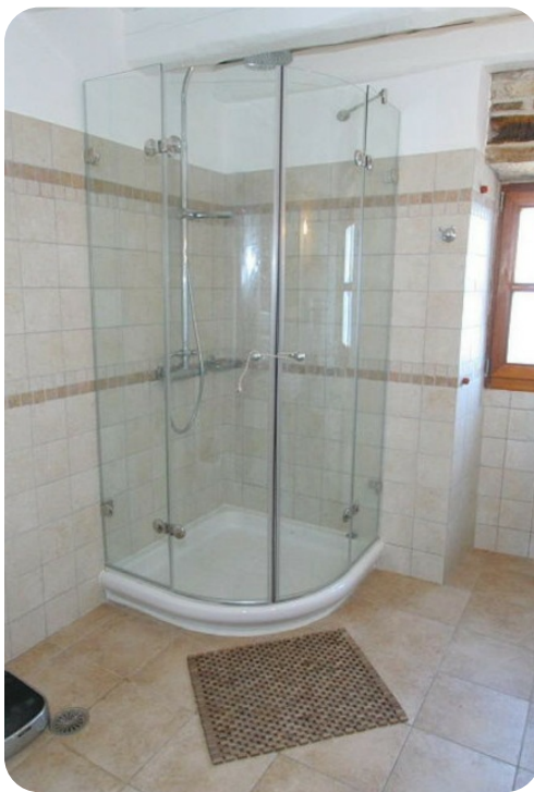
Spiros Jetty House | Page 3 of 6