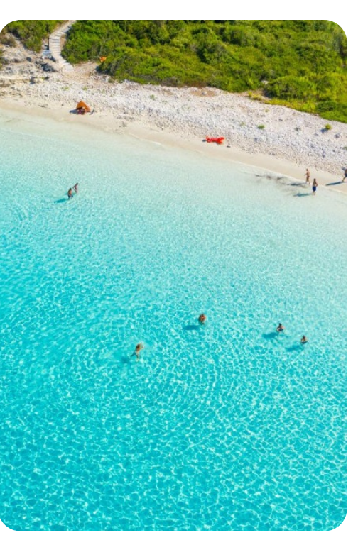
Spiros Jetty House | Page 4 of 6