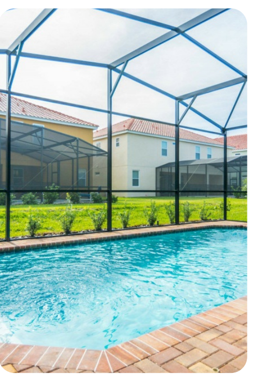
Solterra Resort 224 | Page 8 of 8