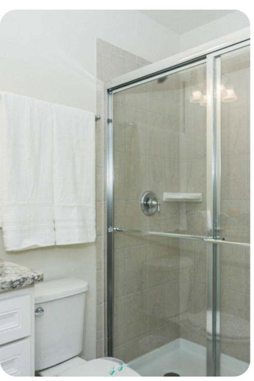
Solterra Resort 224 | Page 6 of 8