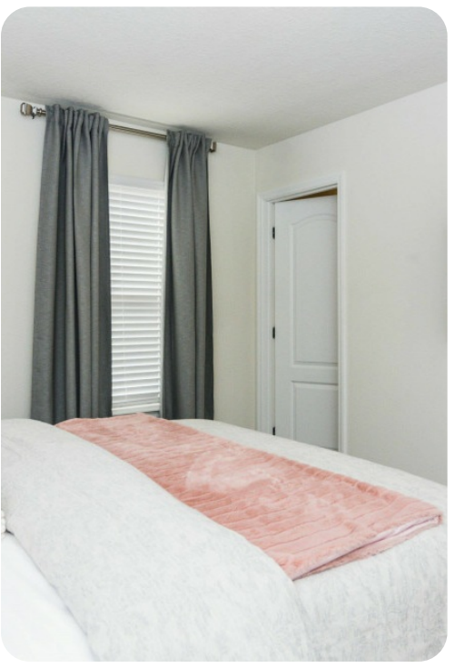
Solterra Resort 224 | Page 5 of 8