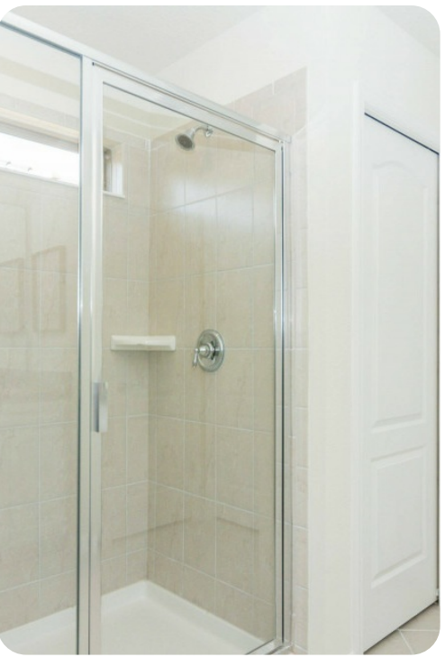
Solterra Resort 224 | Page 4 of 8