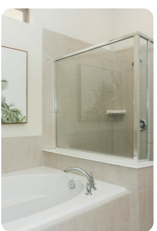
Solterra Resort 224 | Page 7 of 8