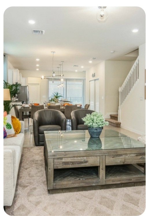
Solterra Resort 224 | Page 2 of 8