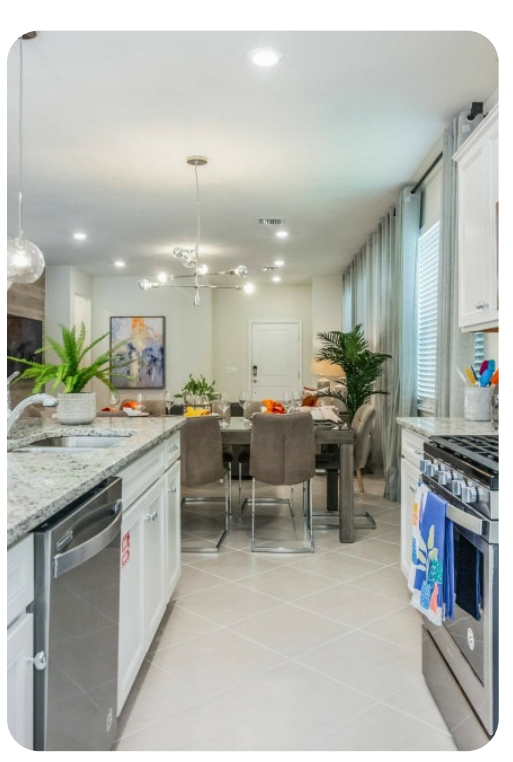
Solterra Resort 224 | Page 3 of 8