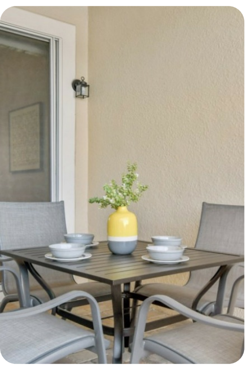
Solara Resort 129 | Page 7 of 8