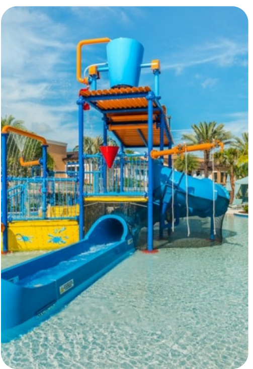
Solara Resort 129 | Page 5 of 8