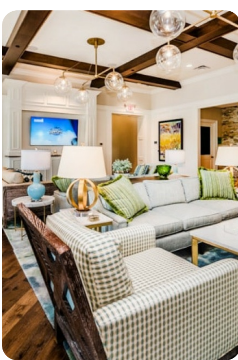
Solara Resort 129 | Page 2 of 8