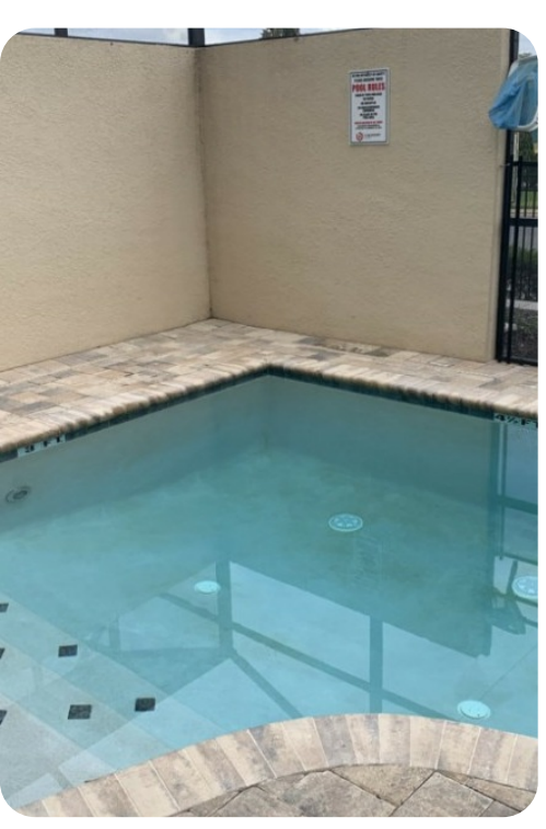
Solara Resort 129 | Page 8 of 8