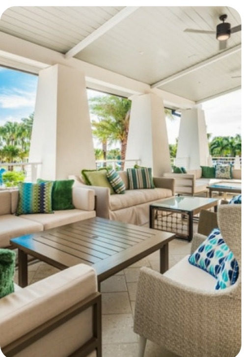
Solara Resort 129 | Page 3 of 8