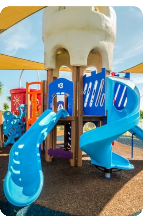
Solara Resort 129 | Page 6 of 8