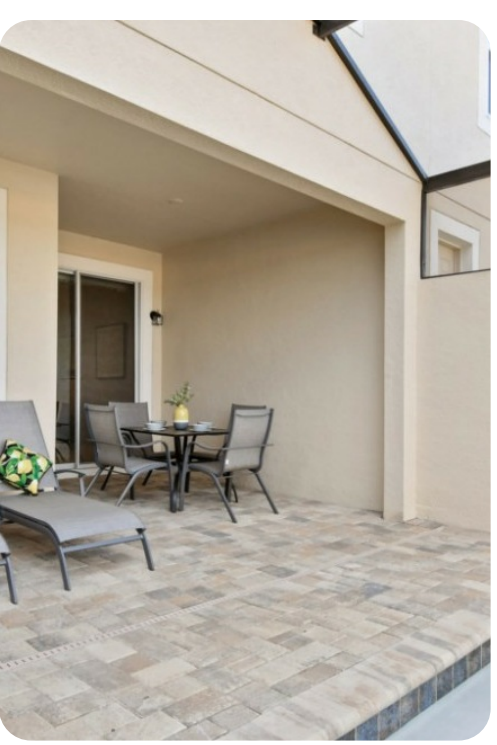
Solara Resort 129 | Page 4 of 8