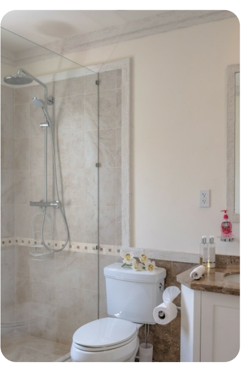
Smugglers Cove 3 | Page 5 of 8