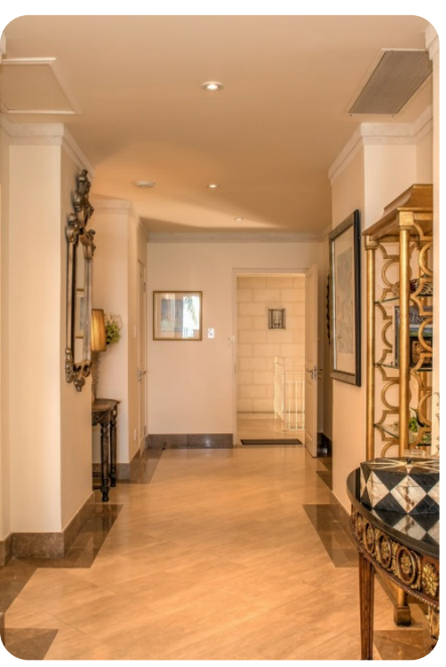
Smugglers Cove 3 | Page 6 of 8