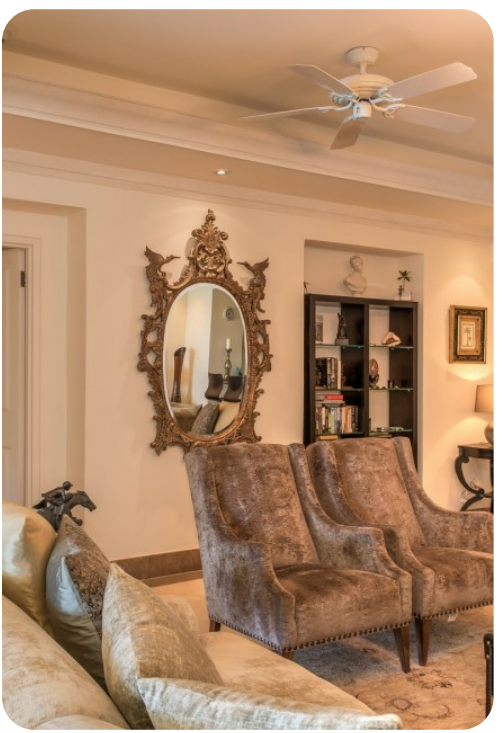
Smugglers Cove 3 | Page 7 of 8