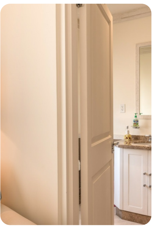
Smugglers Cove 3 | Page 4 of 8