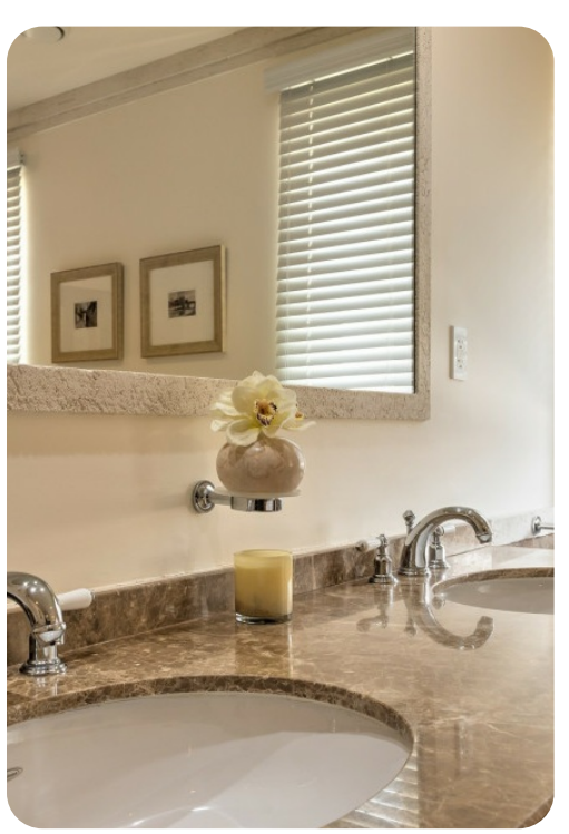
Smugglers Cove 3 | Page 3 of 8