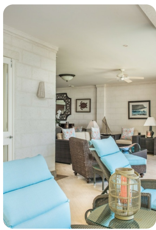
Smugglers Cove 3 | Page 2 of 8