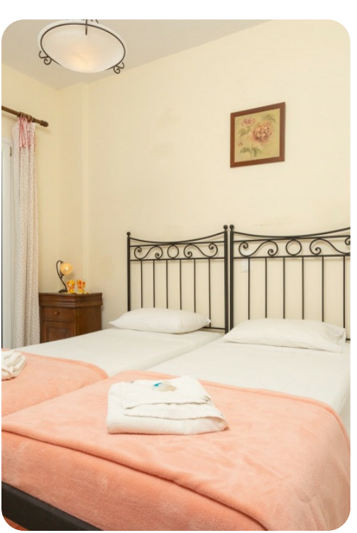
Skala Villa Yellow | Page 5 of 8