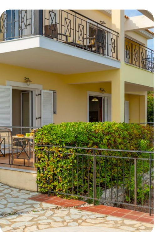
Skala Villa Yellow | Page 8 of 8