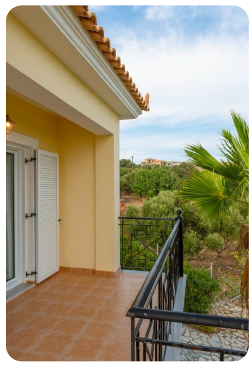
Skala Villa Yellow | Page 4 of 8