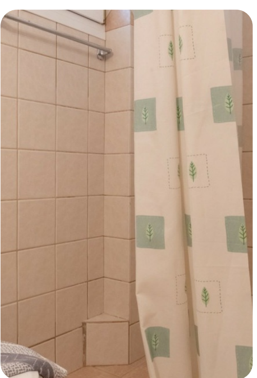
Skala Villa Yellow | Page 6 of 8