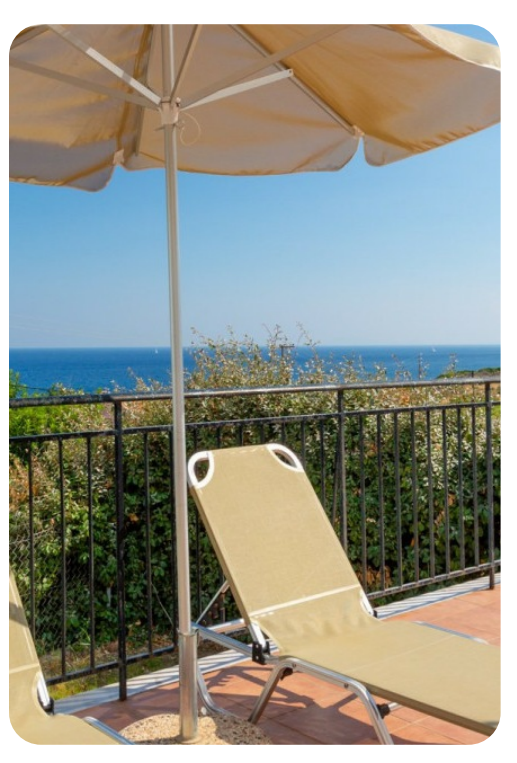
Skala Villa Yellow | Page 7 of 8