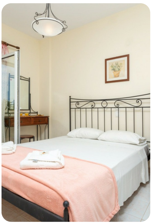
Skala Villa Yellow | Page 3 of 8