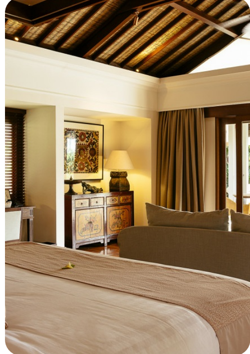
Seseh Tanah Lot 5700 - Villa Semarapura | Page 6 of 8