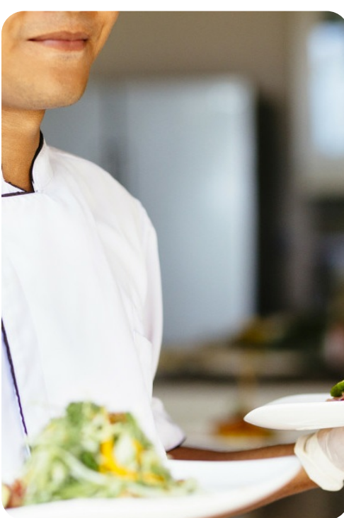
Seseh Tanah Lot 5700 - Villa Semarapura | Page 3 of 8