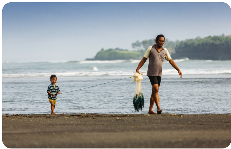
Seseh Tanah Lot 5700 - Villa Semarapura | Page 1 of 8