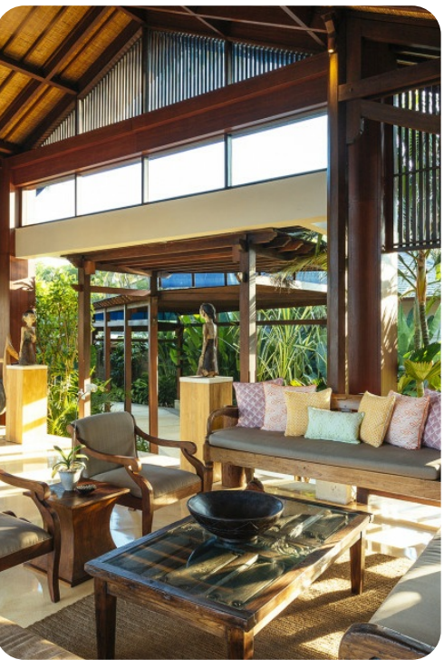
Seseh Tanah Lot 5700 - Villa Semarapura | Page 7 of 8