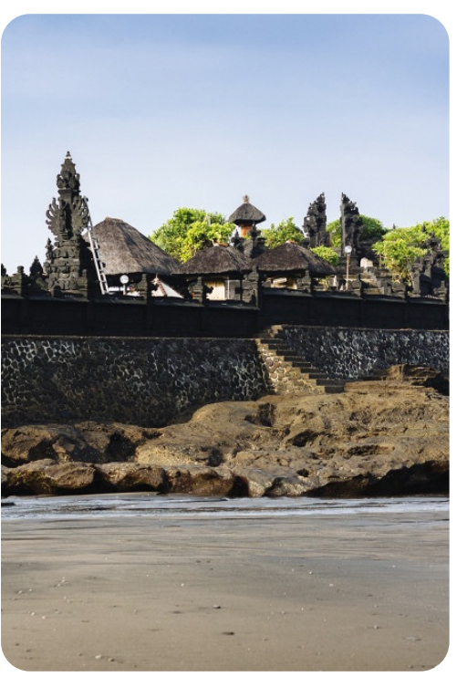
Seseh Tanah Lot 5700 - Villa Semarapura | Page 2 of 8