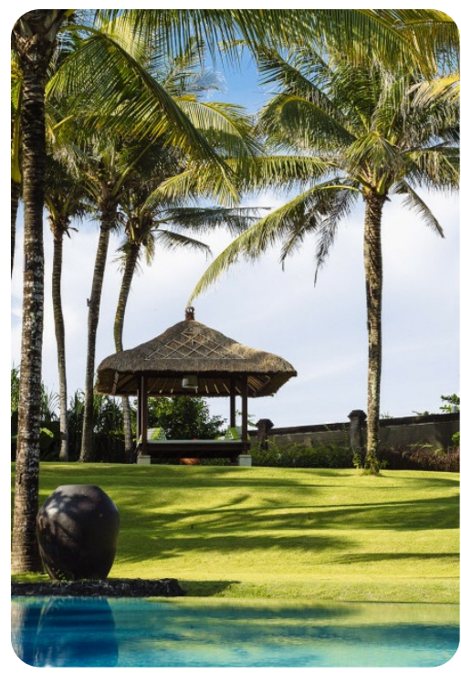
Seseh Tanah Lot 5700 - Villa Semarapura | Page 4 of 8