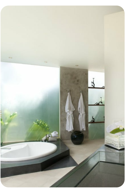
Seminyak 3719 - The Layar 10 | Page 4 of 5