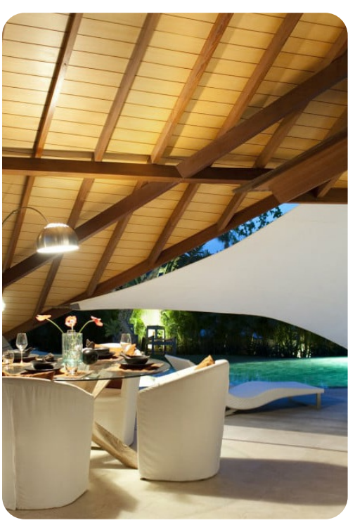
Seminyak 3719 - The Layar 10 | Page 2 of 5