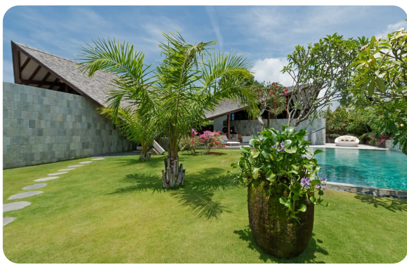
Seminyak 3719 - The Layar 10 | Page 1 of 5