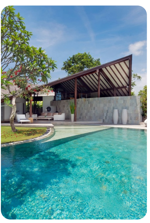
Seminyak 3719 - The Layar 10 | Page 3 of 5