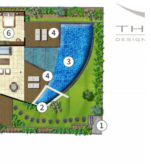
Seminyak 3719 - The Layar 10 | Page 5 of 5