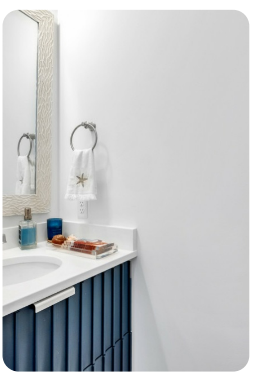
Seagrove 5 | Page 8 of 8