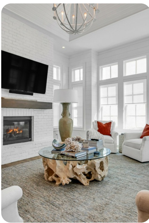
Seagrove 5 | Page 2 of 8