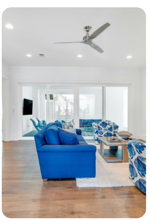
Seagrove 5 | Page 4 of 8