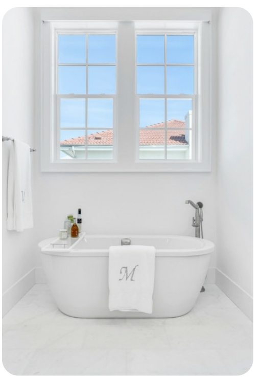
Seagrove 5 | Page 6 of 8