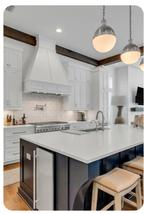
Seagrove 5 | Page 3 of 8