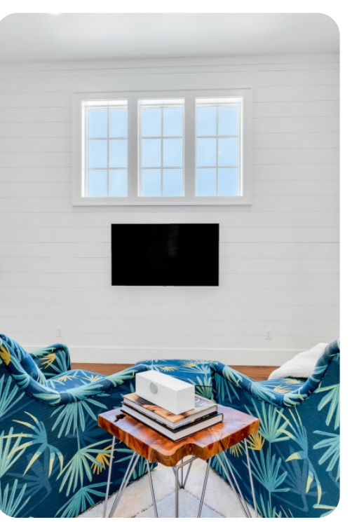
Seagrove 5 | Page 5 of 8