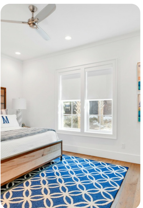
Seagrove 5 | Page 7 of 8