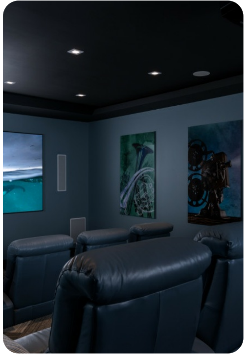
Seaclusion - Grace Bay | Page 2 of 8