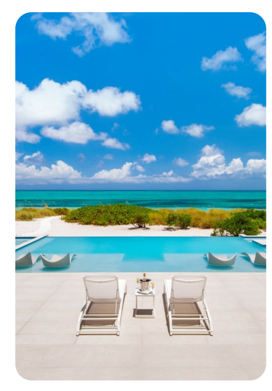
Seaclusion - Grace Bay | Page 6 of 8