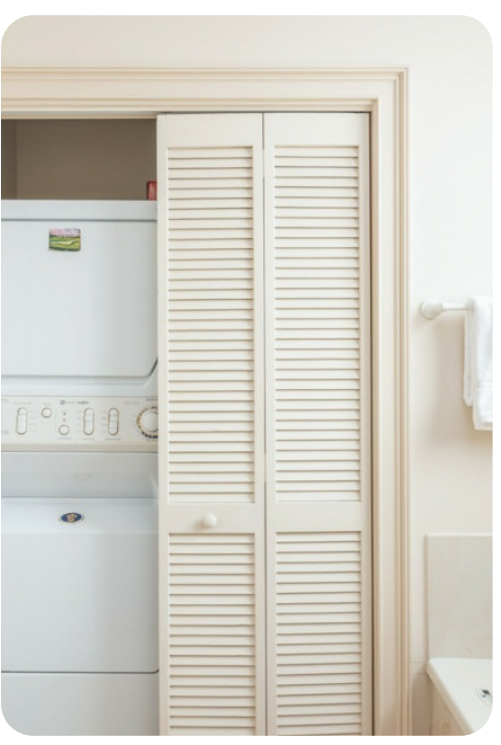
Sea Islands 16 | Page 7 of 8