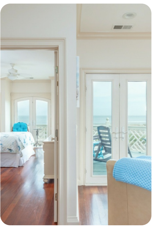
Sea Islands 16 | Page 8 of 8