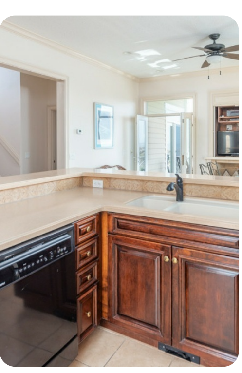
Sea Islands 16 | Page 3 of 8