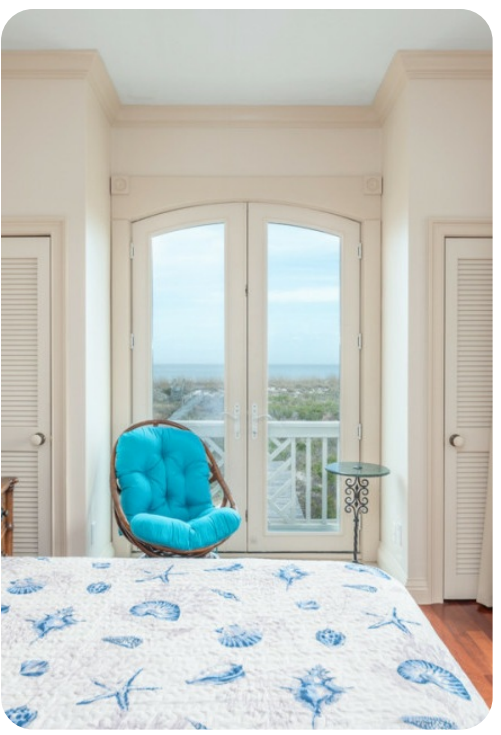
Sea Islands 16 | Page 4 of 8