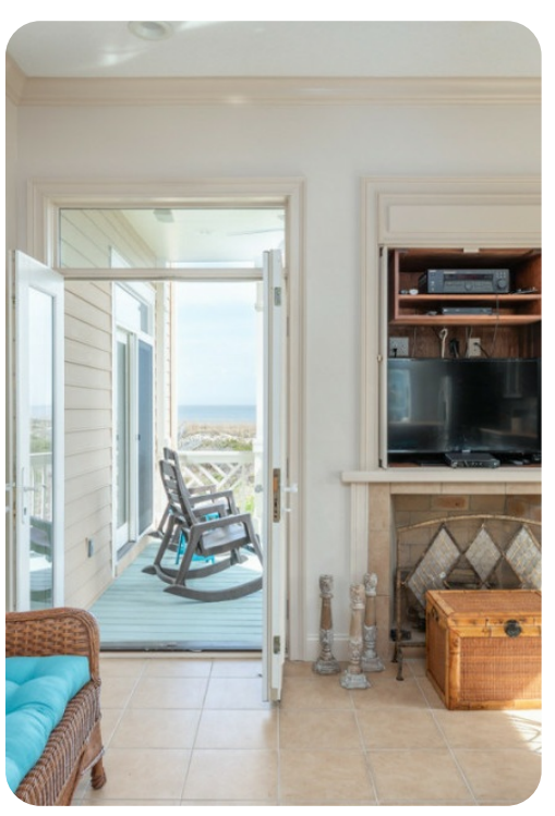
Sea Islands 16 | Page 2 of 8