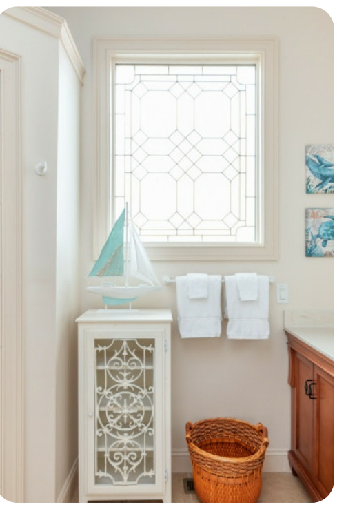
Sea Islands 16 | Page 5 of 8