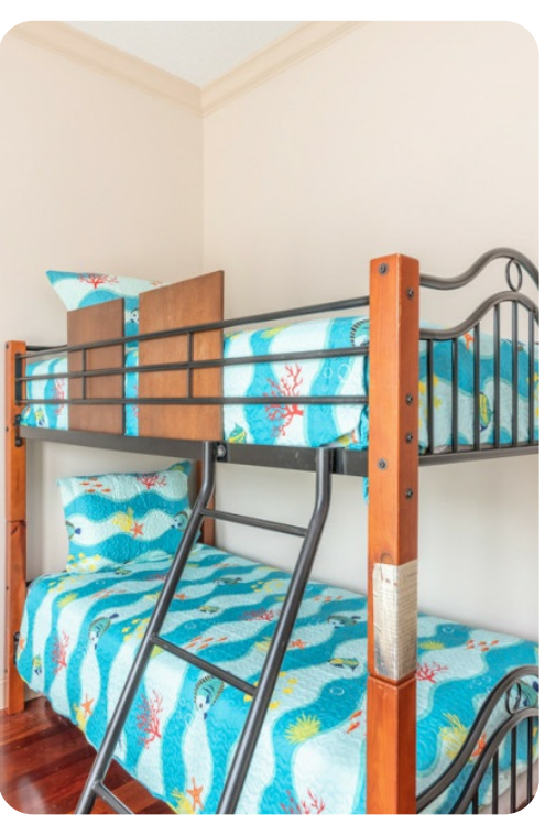
Sea Islands 16 | Page 6 of 8