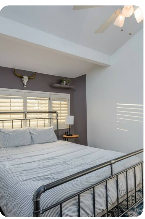
Scottsdale 99 | Page 5 of 8