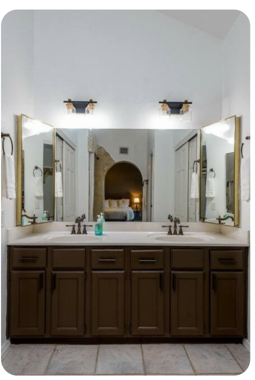
Scottsdale 99 | Page 6 of 8