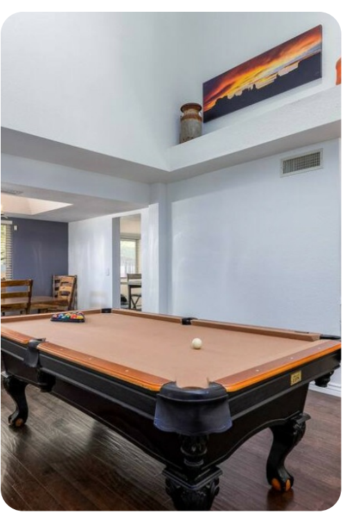
Scottsdale 99 | Page 4 of 8