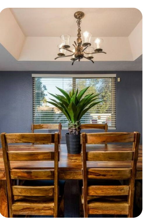
Scottsdale 99 | Page 3 of 8