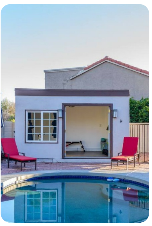
Scottsdale 99 | Page 8 of 8