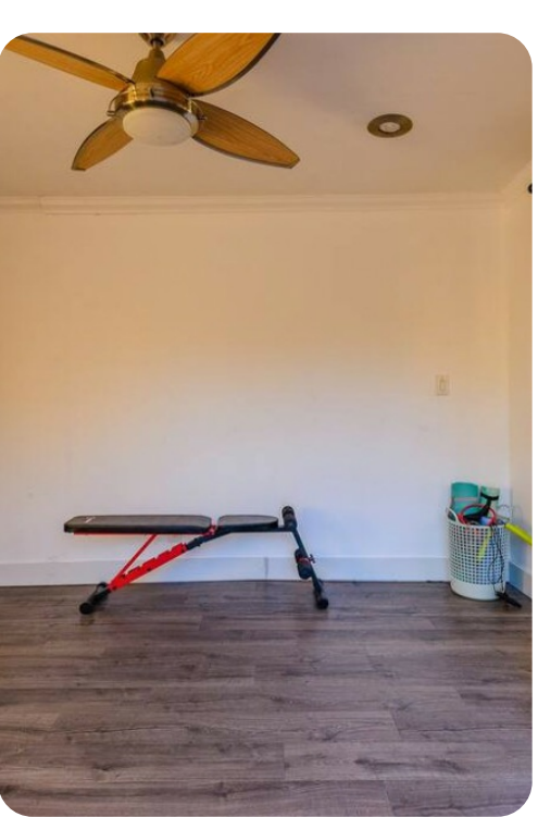
Scottsdale 99 | Page 7 of 8