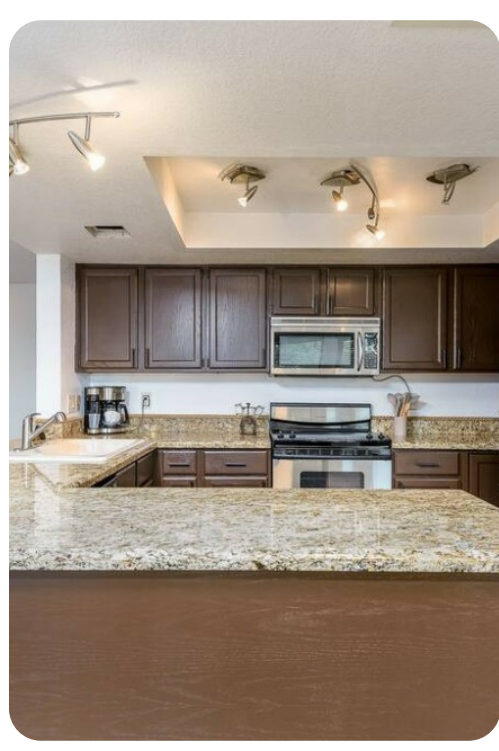
Scottsdale 99 | Page 2 of 8