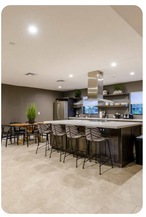
Scottsdale 98 | Page 3 of 8