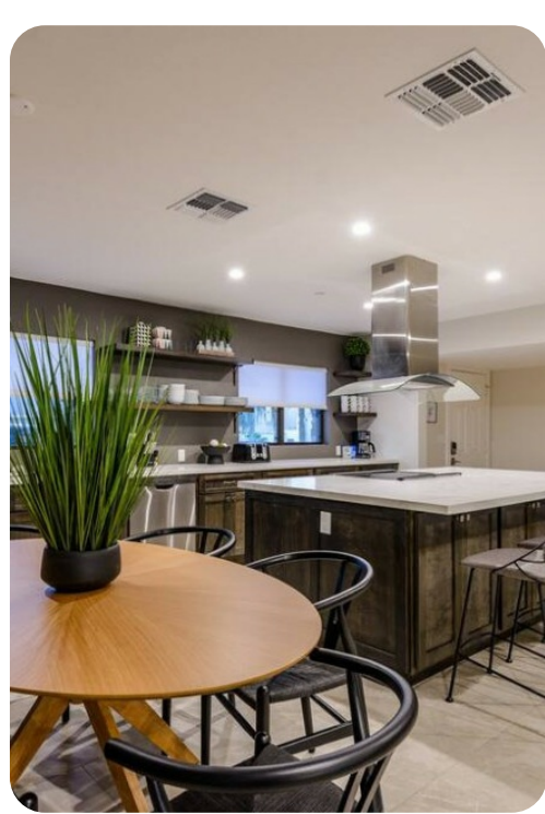
Scottsdale 98 | Page 2 of 8