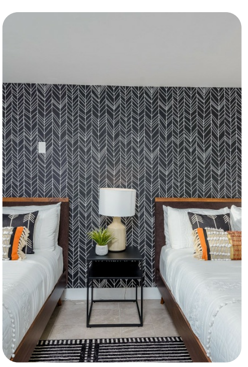
Scottsdale 98 | Page 4 of 8