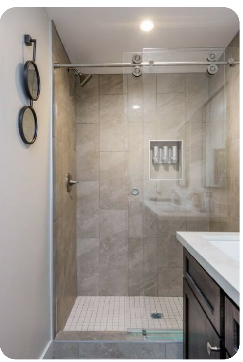
Scottsdale 98 | Page 6 of 8