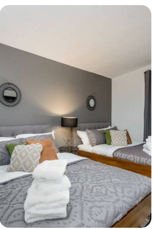
Scottsdale 98 | Page 5 of 8