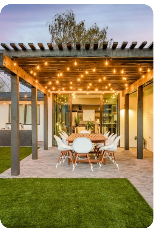
Scottsdale 98 | Page 8 of 8