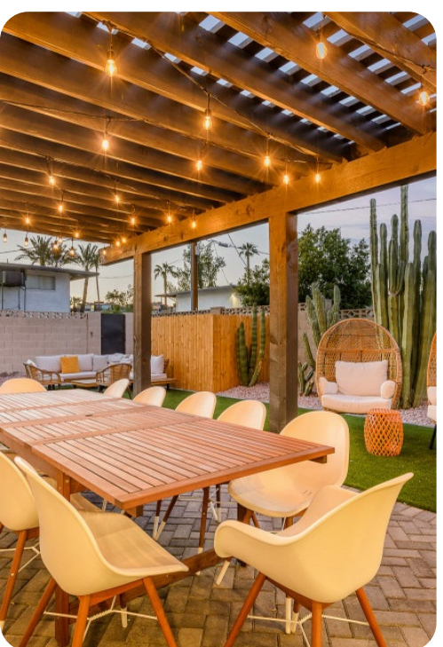
Scottsdale 98 | Page 7 of 8