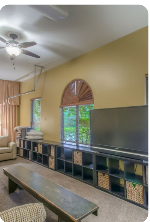
Scottsdale 89 | Page 7 of 8