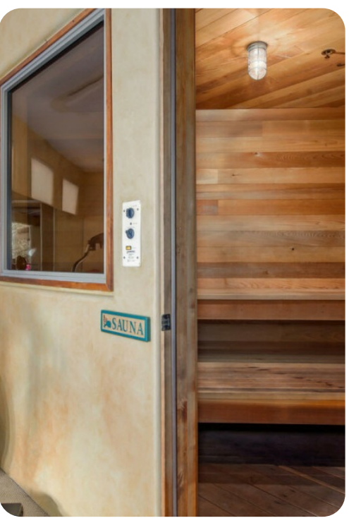
Scottsdale 89 | Page 8 of 8