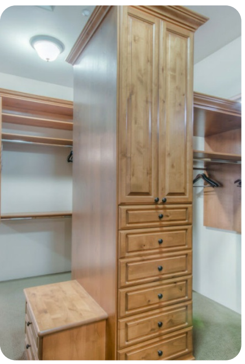
Scottsdale 89 | Page 4 of 8