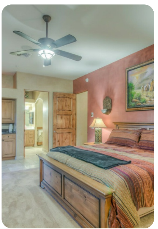
Scottsdale 89 | Page 5 of 8