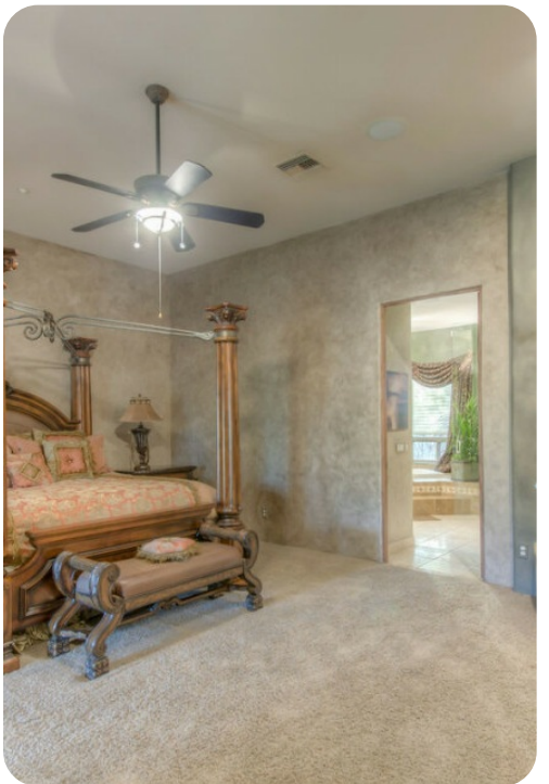
Scottsdale 89 | Page 3 of 8