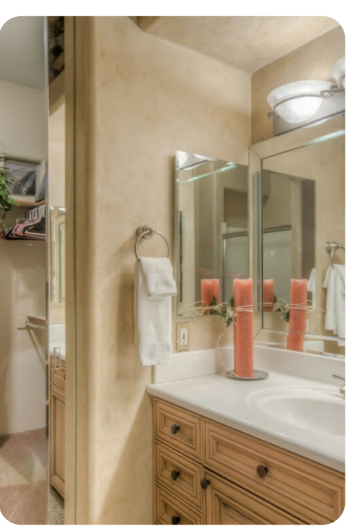
Scottsdale 89 | Page 6 of 8