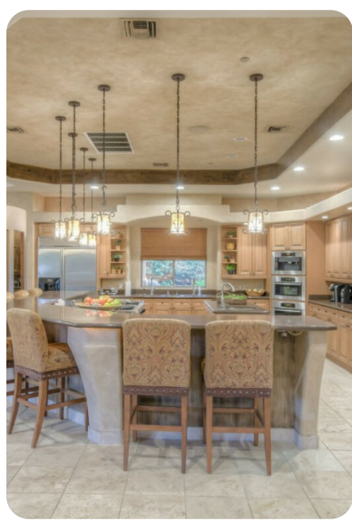
Scottsdale 89 | Page 2 of 8