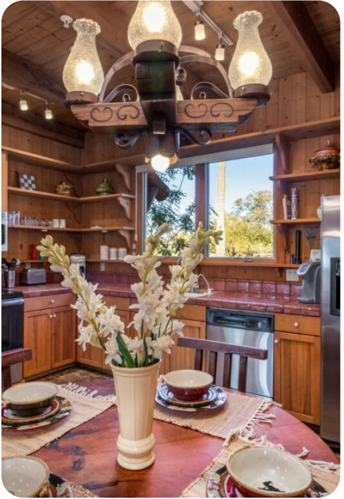
Scottsdale 84 | Page 3 of 8