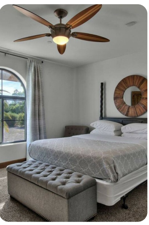
Scottsdale 78 | Page 4 of 7