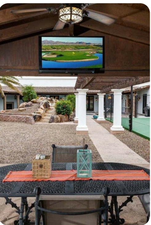
Scottsdale 78 | Page 5 of 7