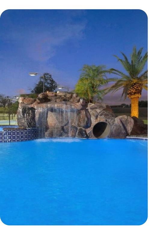
Scottsdale 78 | Page 6 of 7