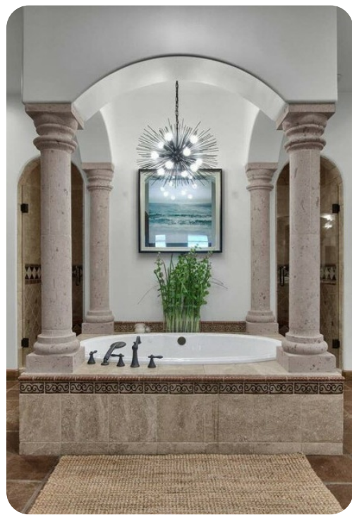
Scottsdale 78 | Page 3 of 7