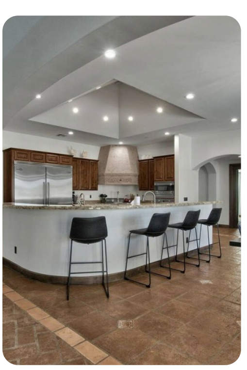
Scottsdale 78 | Page 2 of 7