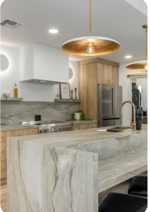
Scottsdale 201 | Page 3 of 8