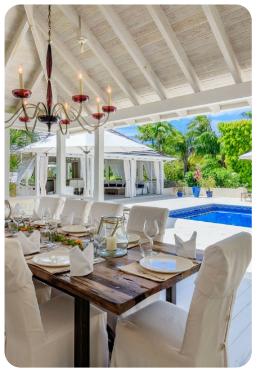
Sandy Lane - Tradewinds | Page 6 of 8