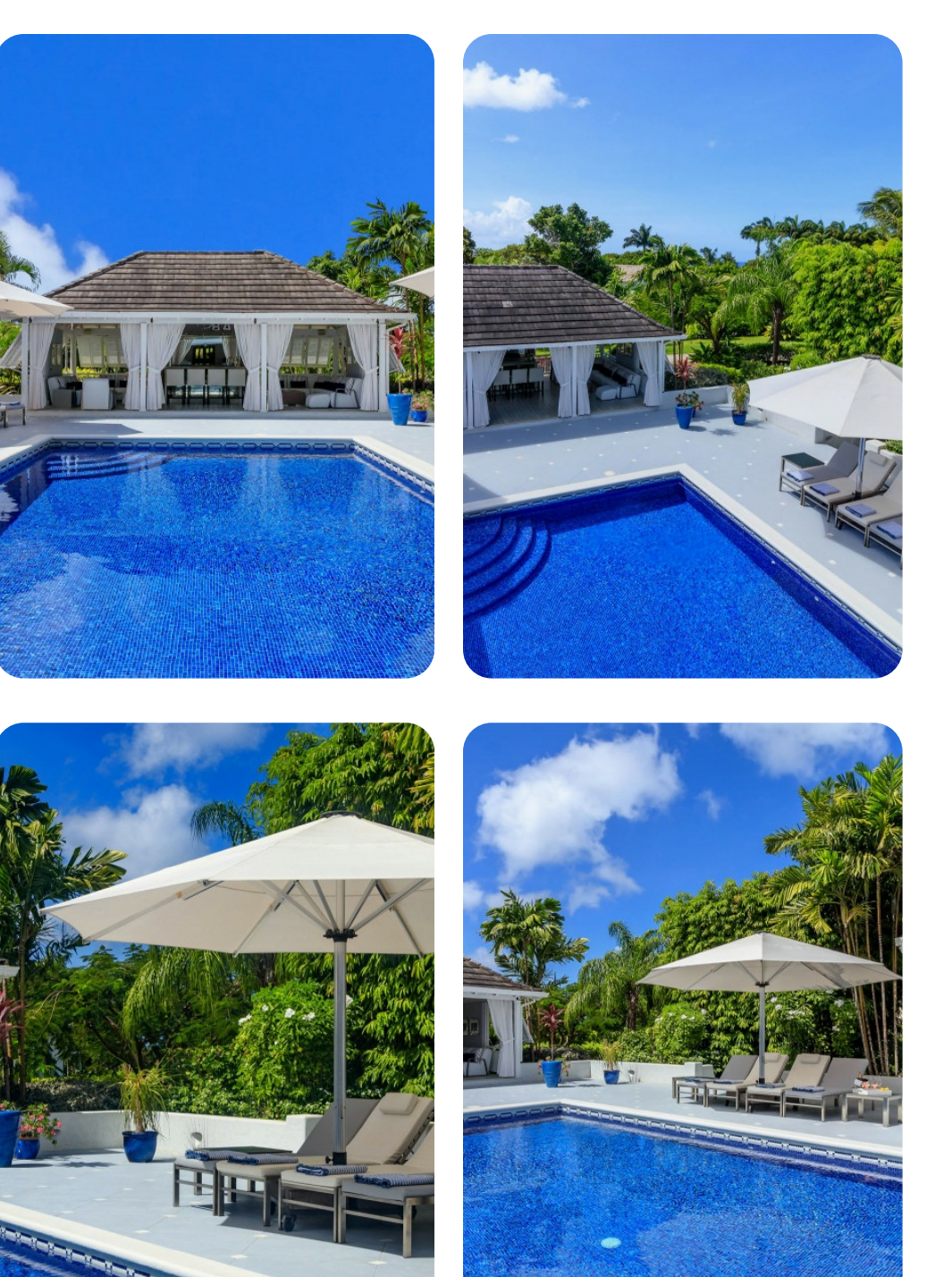
Sandy Lane - Tradewinds | Page 7 of 8