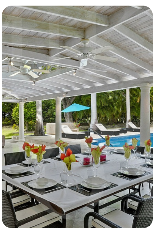
Sandy Lane - Amberley House | Page 5 of 6