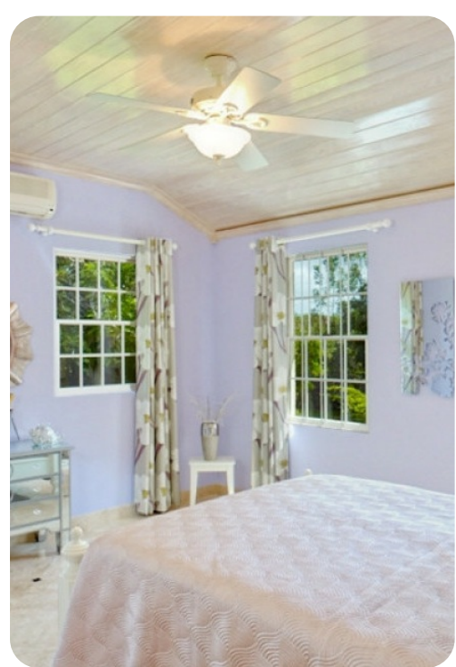
Sandy Lane - Amberley House | Page 3 of 6