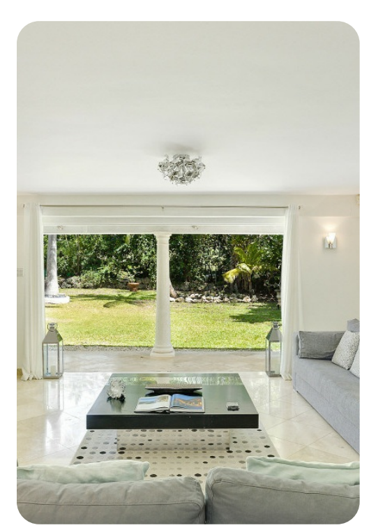
Sandy Lane - Amberley House | Page 2 of 6