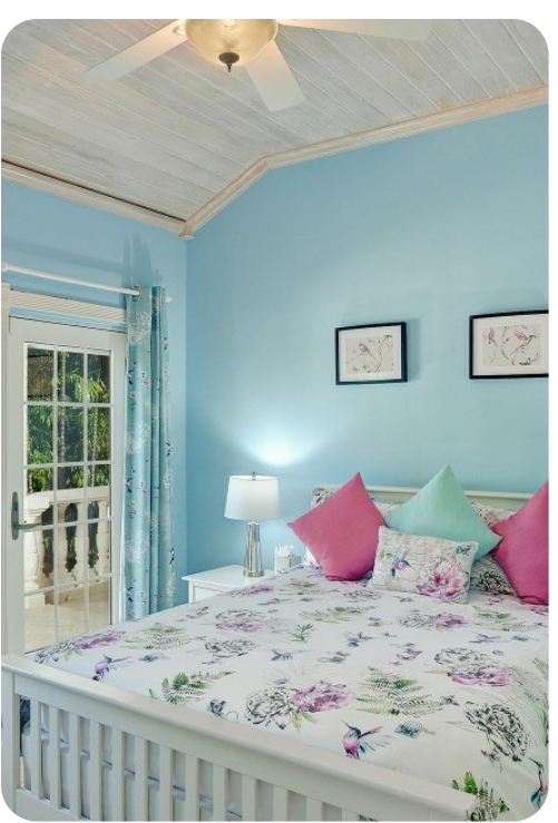
Sandy Lane - Amberley House | Page 4 of 6