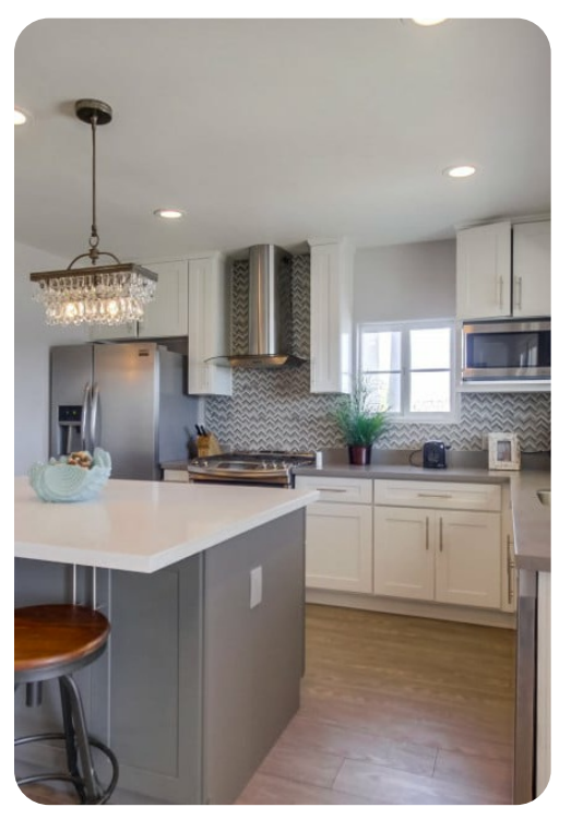
San Diego 86 | Page 3 of 7