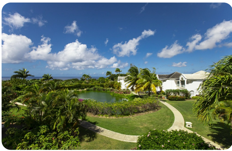
Royal Westmoreland - Royal Villa 7 | Page 1 of 5