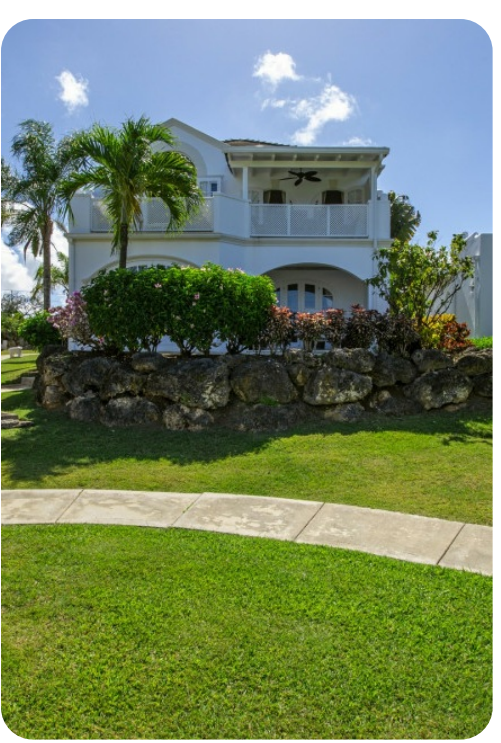
Royal Westmoreland - Royal Villa 7 | Page 4 of 5