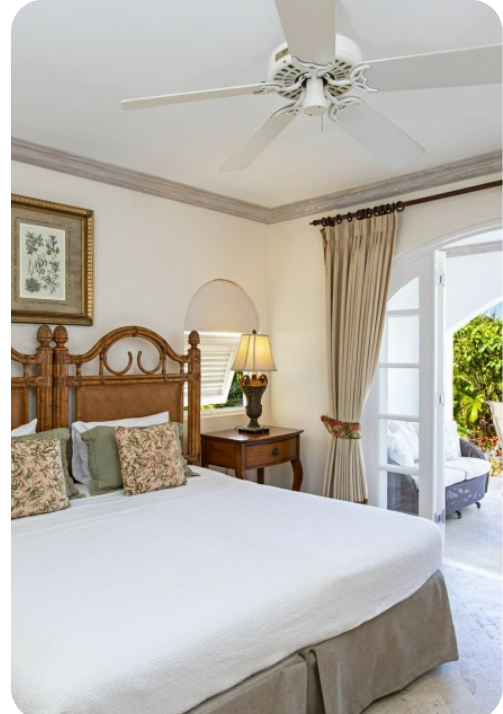
Royal Westmoreland - Royal Villa 7 | Page 3 of 5