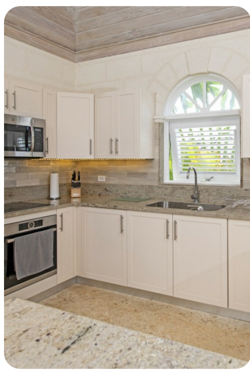
Royal Westmoreland - Royal Villa 7 | Page 2 of 5