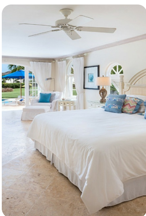
Royal Westmoreland - Royal Villa 19 | Page 2 of 4