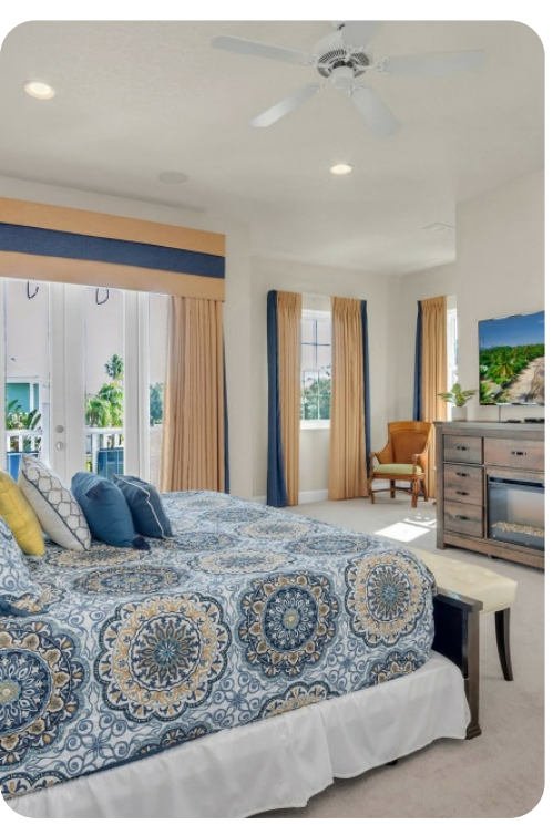
Reunion Resort 198 | Page 5 of 8