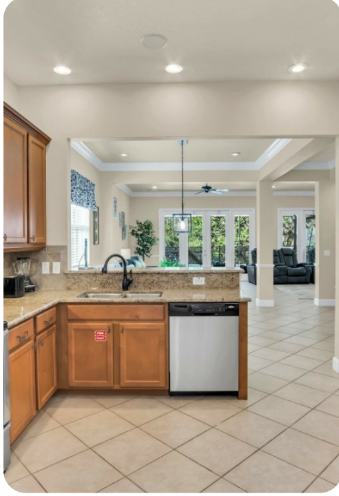
Reunion Resort 198 | Page 4 of 8