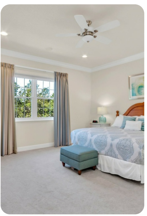
Reunion Resort 198 | Page 6 of 8