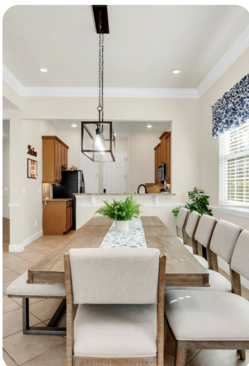
Reunion Resort 198 | Page 3 of 8