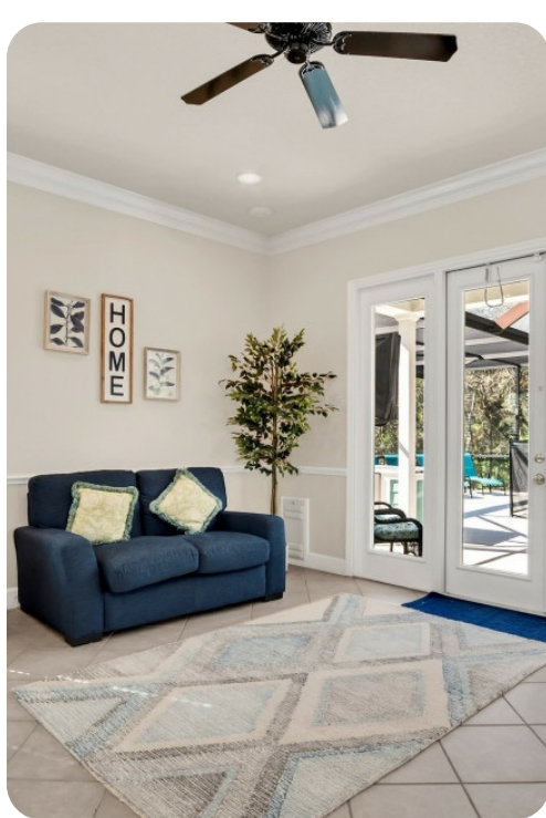
Reunion Resort 198 | Page 2 of 8