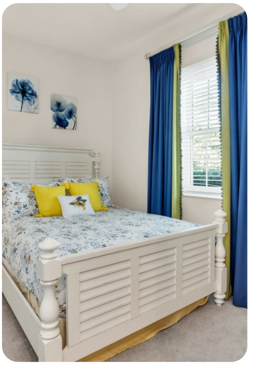
Reunion Resort 198 | Page 7 of 8