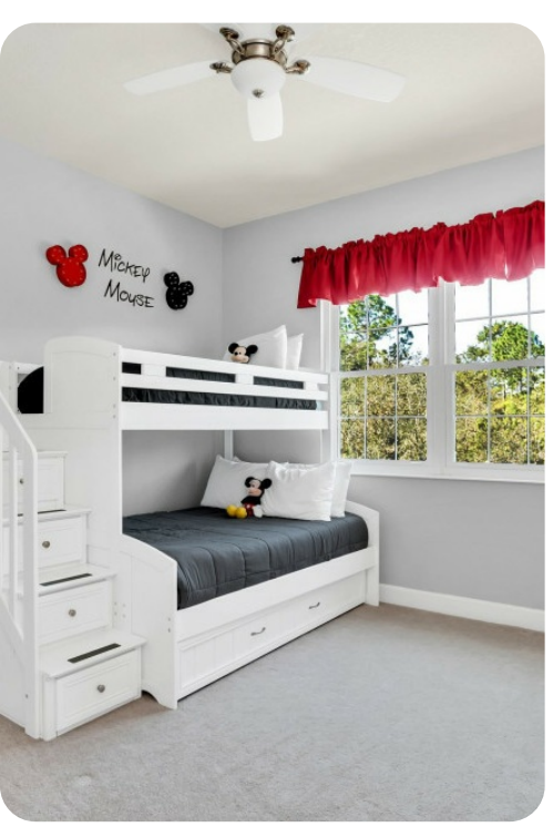
Reunion Resort 198 | Page 8 of 8