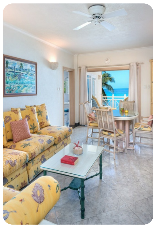
Reeds House 1 - 4-bed | Page 2 of 6