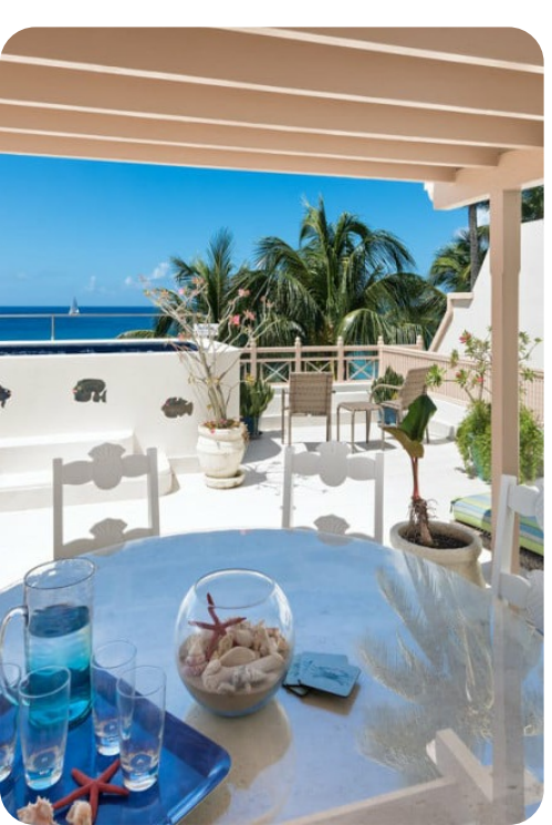
Reeds House 1 - 4-bed | Page 5 of 6