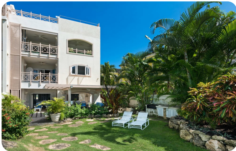
Reeds House 1 - 4-bed | Page 1 of 6