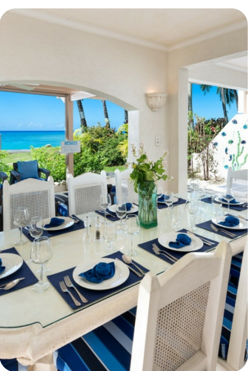
Reeds House 1 - 4-bed | Page 3 of 6