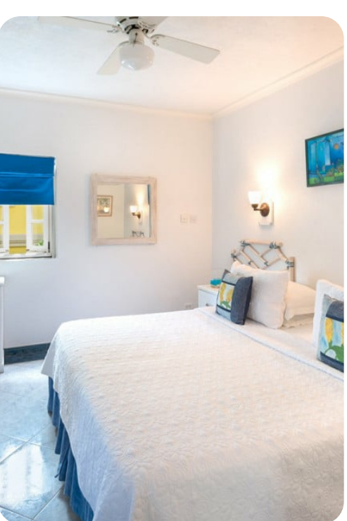
Reeds House 1 - 4-bed | Page 4 of 6