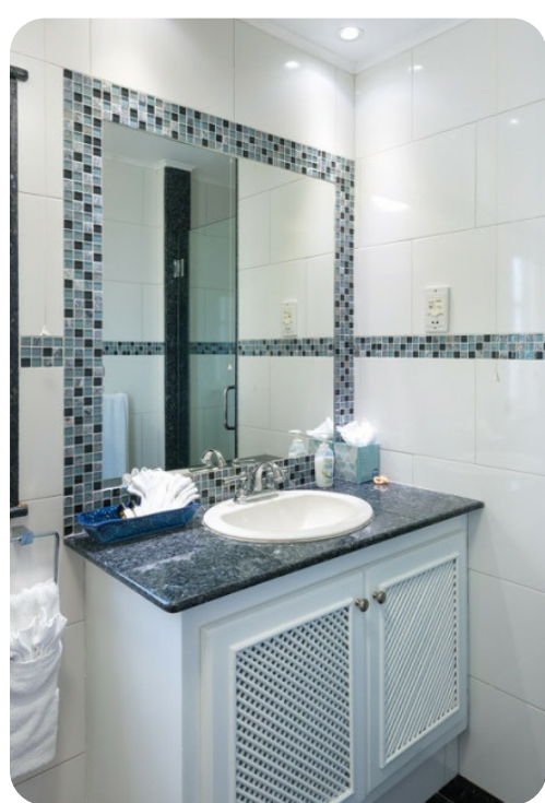
Reeds House 1 - 3-bed | Page 3 of 4