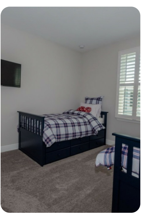
Redington Beach 1 | Page 7 of 8