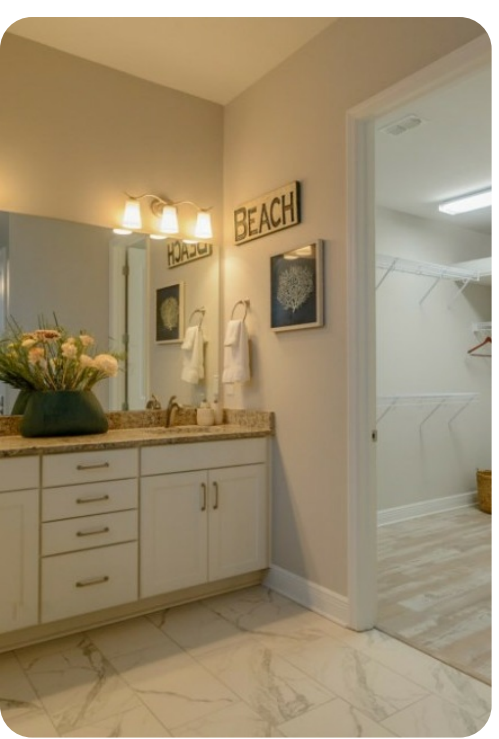
Redington Beach 1 | Page 4 of 8