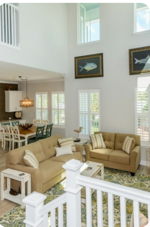
Redington Beach 1 | Page 2 of 8