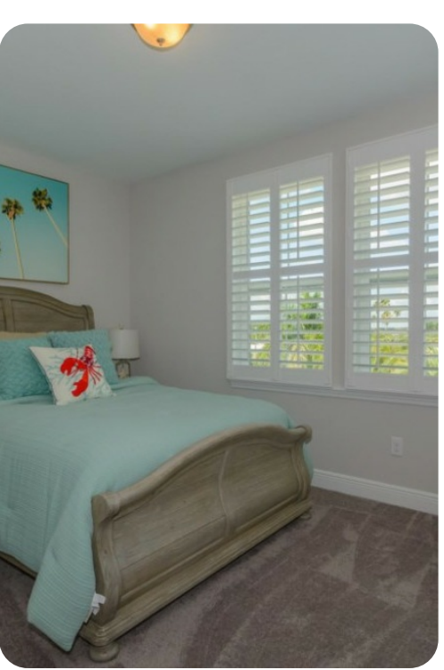
Redington Beach 1 | Page 5 of 8