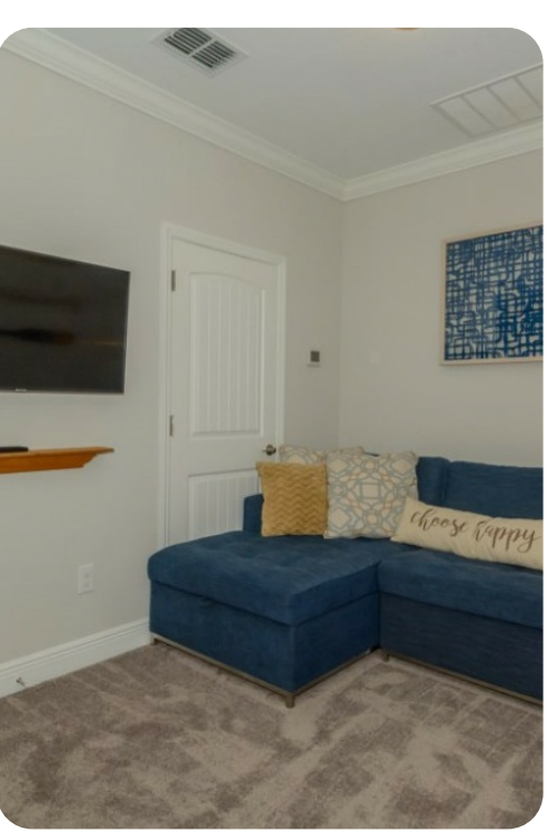
Redington Beach 1 | Page 6 of 8