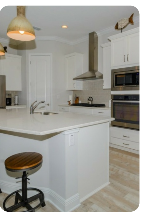
Redington Beach 1 | Page 3 of 8