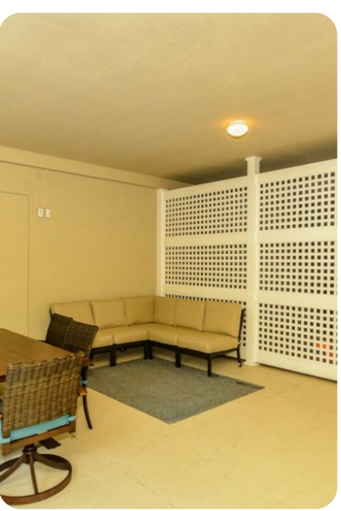
Redington Beach 1 | Page 8 of 8