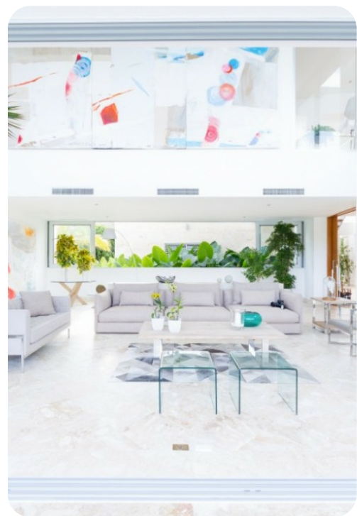
Punta Cana Resort & Club 27 | Page 2 of 6