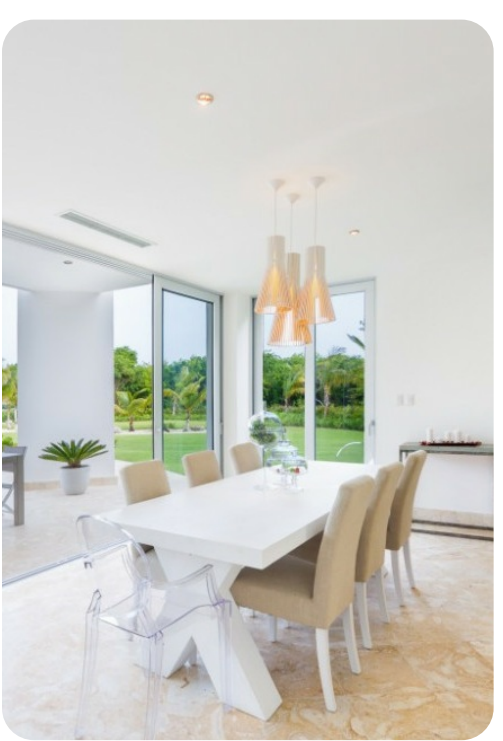
Punta Cana Resort & Club 27 | Page 3 of 6