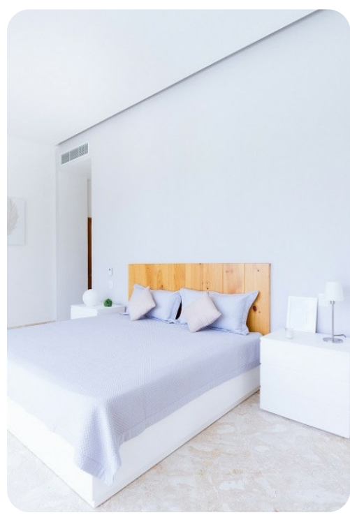
Punta Cana Resort & Club 27 | Page 5 of 6