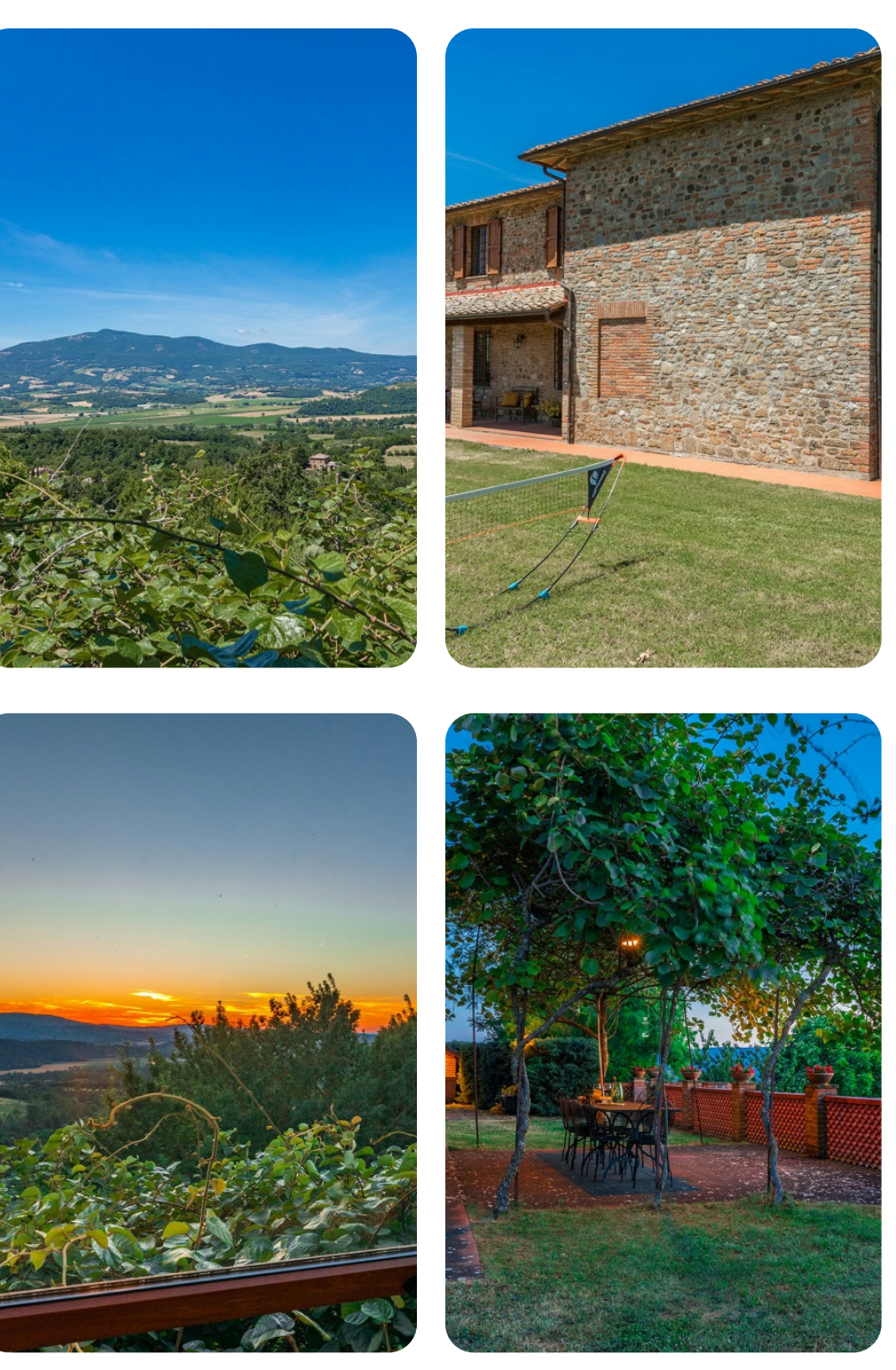
Poggio Medei | Page 6 of 8