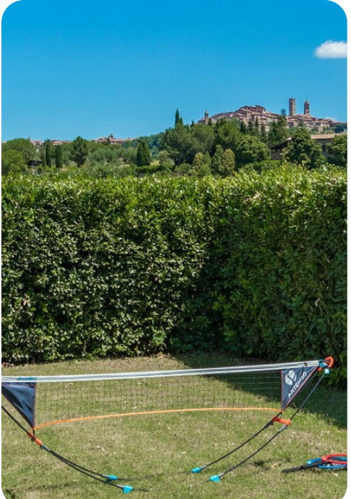
Poggio Medei | Page 4 of 8