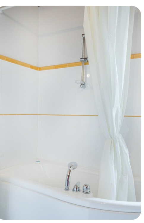
Podere Montioni | Page 6 of 8