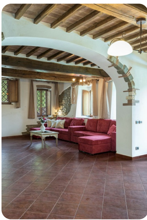
Podere Montioni | Page 2 of 8