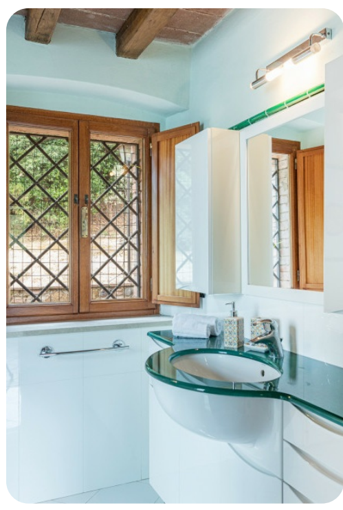
Podere Montioni | Page 4 of 8