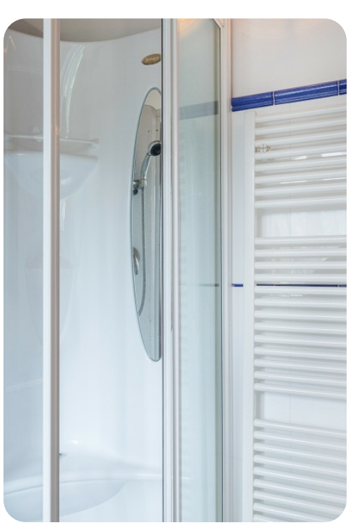
Podere Montioni | Page 5 of 8