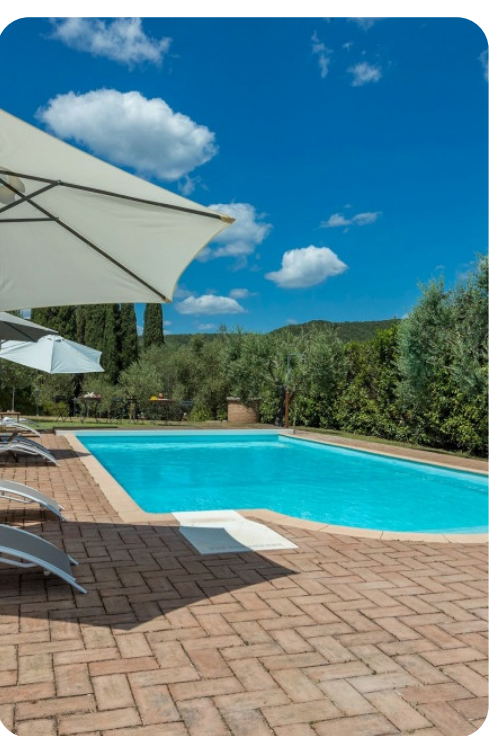
Podere Montioni | Page 7 of 8