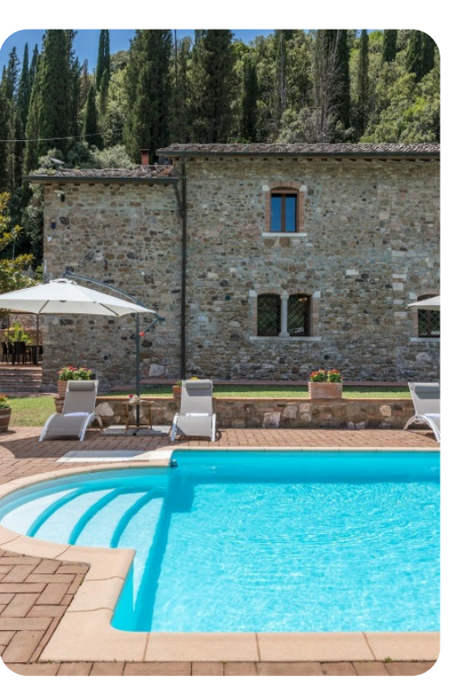
Podere Montioni | Page 8 of 8