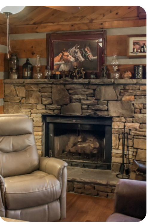
Pigeon Forge 58 | Page 5 of 7