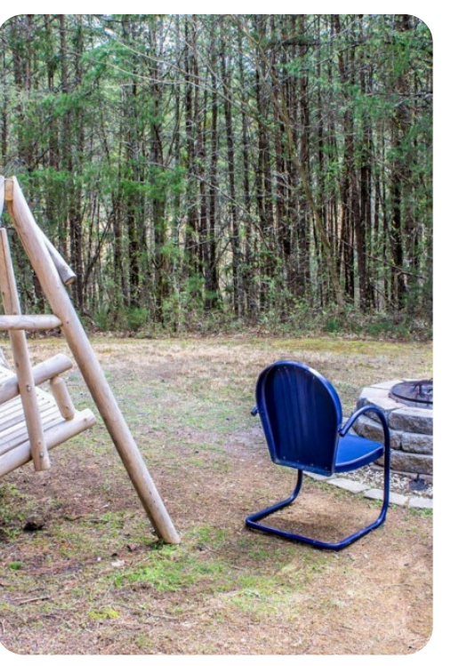
Pigeon Forge 58 | Page 4 of 7