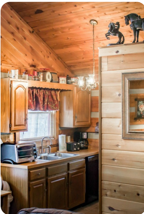
Pigeon Forge 58 | Page 2 of 7