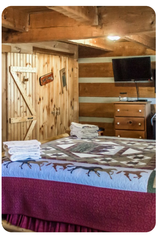
Pigeon Forge 58 | Page 6 of 7