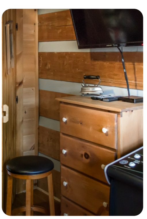
Pigeon Forge 58 | Page 3 of 7