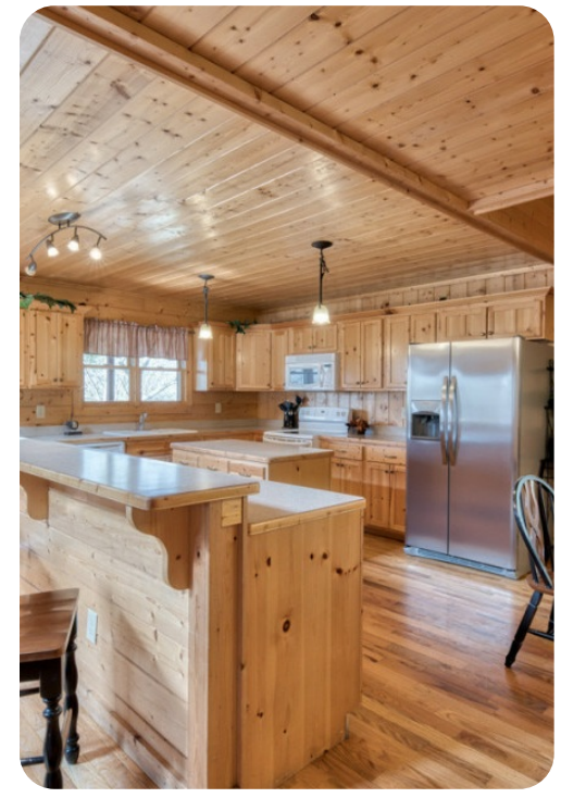
Pigeon Forge 57 | Page 2 of 8