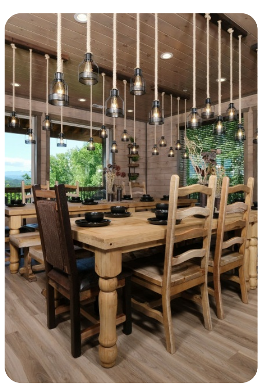
Pigeon Forge 40 | Page 3 of 8