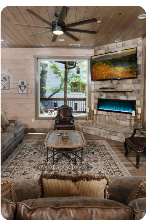
Pigeon Forge 40 | Page 2 of 8