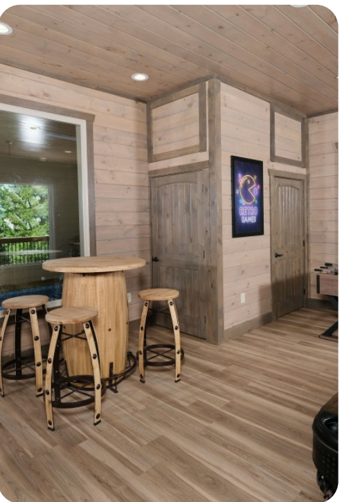
Pigeon Forge 40 | Page 6 of 8