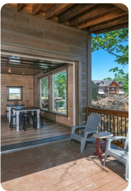
Pigeon Forge 40 | Page 5 of 8