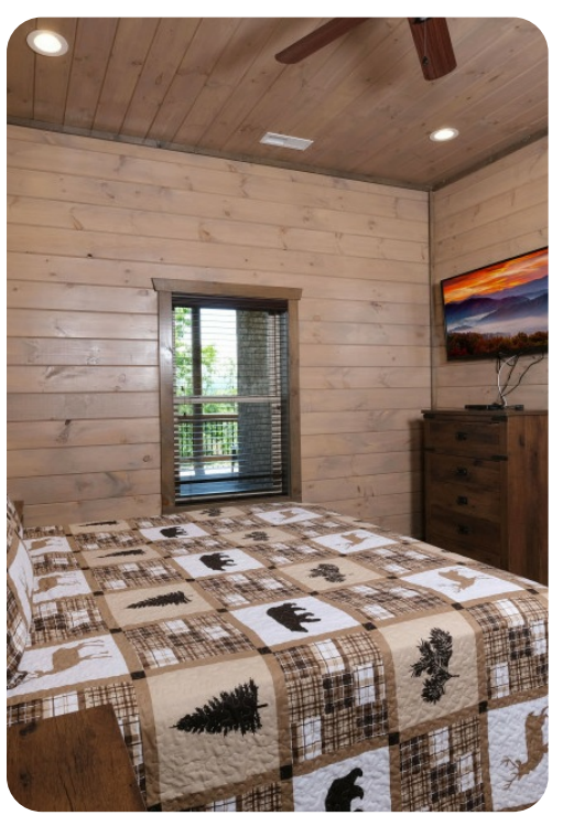
Pigeon Forge 40 | Page 8 of 8