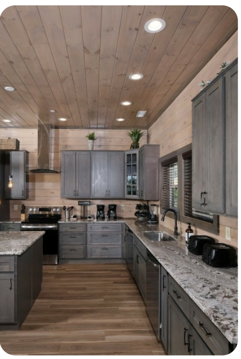
Pigeon Forge 40 | Page 4 of 8