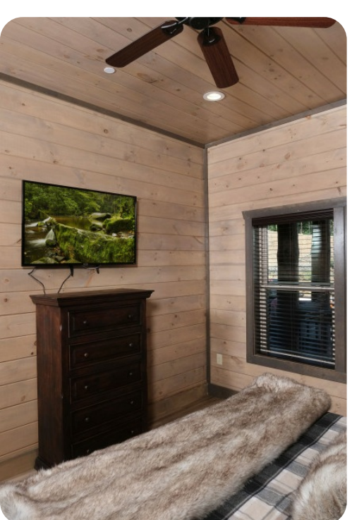
Pigeon Forge 40 | Page 7 of 8