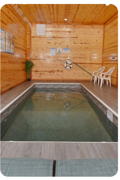
Pigeon Forge 39 | Page 8 of 8