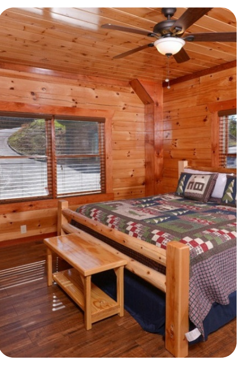
Pigeon Forge 39 | Page 5 of 8