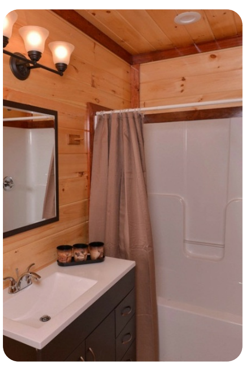
Pigeon Forge 39 | Page 7 of 8