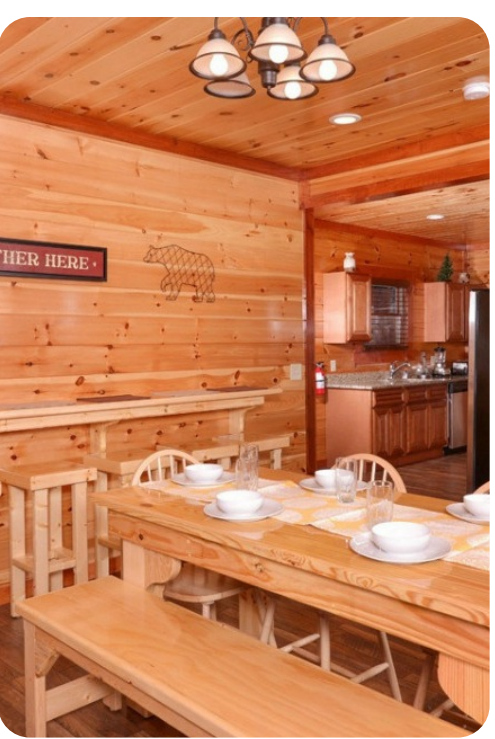
Pigeon Forge 39 | Page 4 of 8