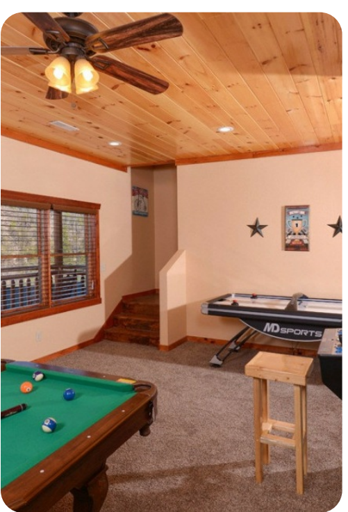
Pigeon Forge 39 | Page 3 of 8