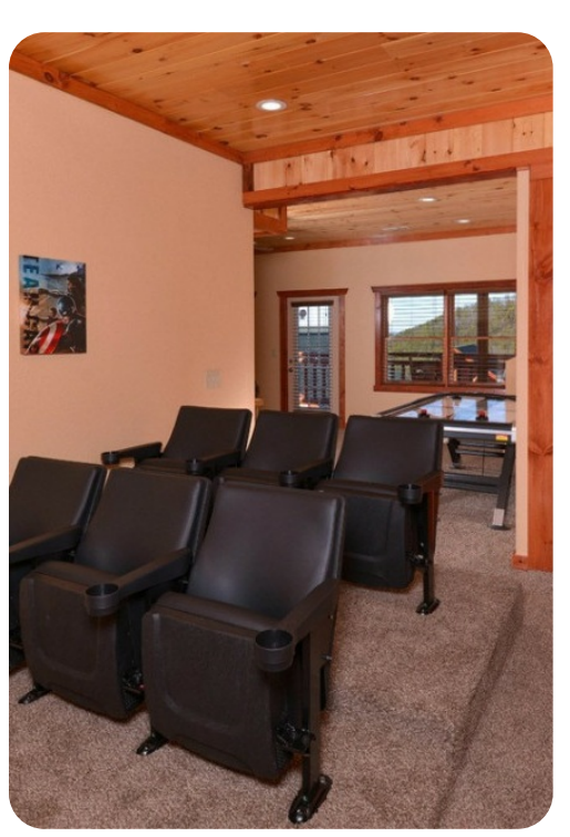
Pigeon Forge 39 | Page 2 of 8