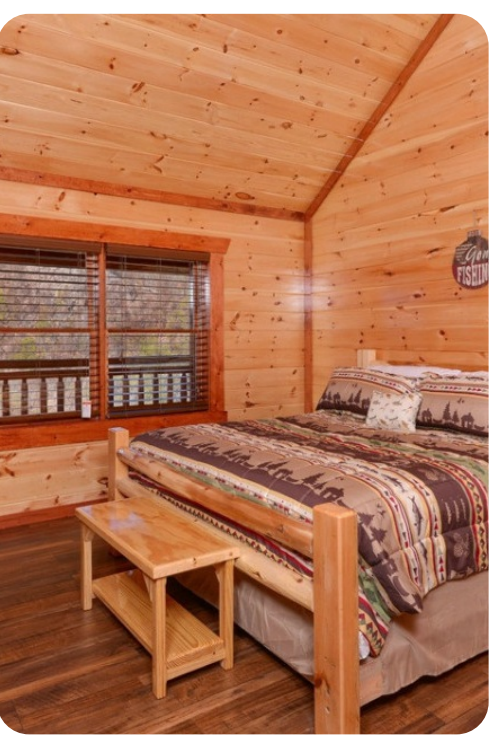
Pigeon Forge 39 | Page 6 of 8