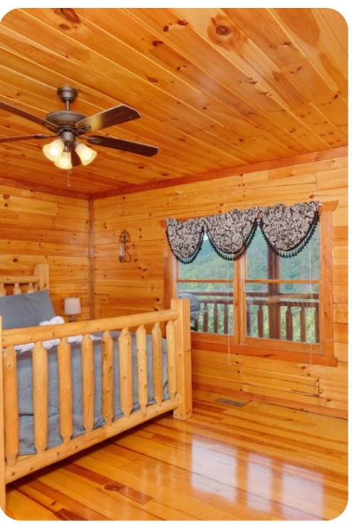
Pigeon Forge 37 | Page 4 of 8