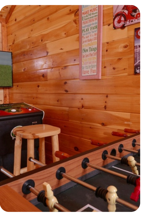
Pigeon Forge 37 | Page 3 of 8