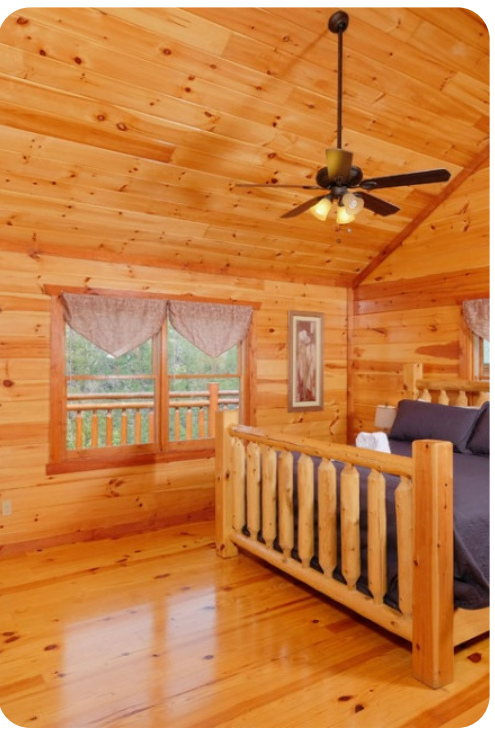
Pigeon Forge 37 | Page 5 of 8