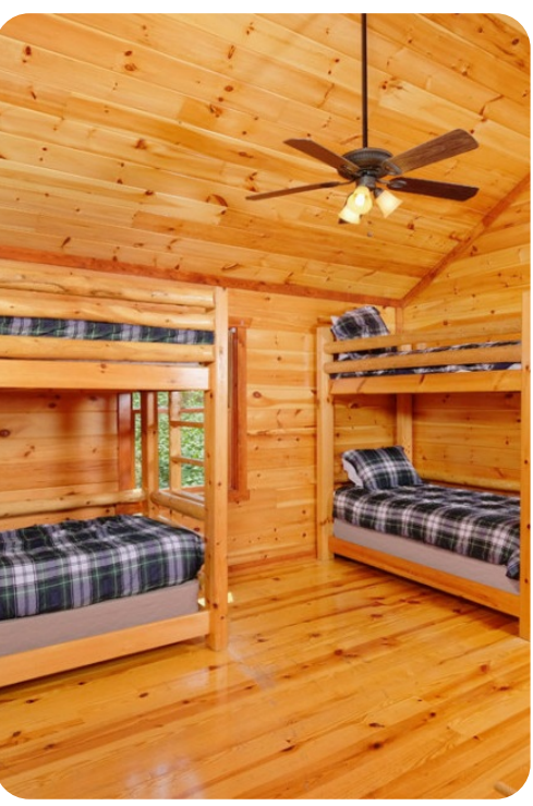
Pigeon Forge 37 | Page 7 of 8