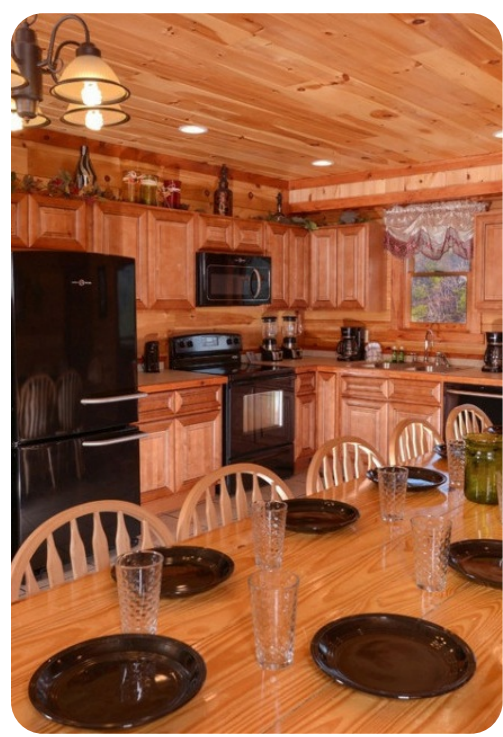
Pigeon Forge 37 | Page 2 of 8