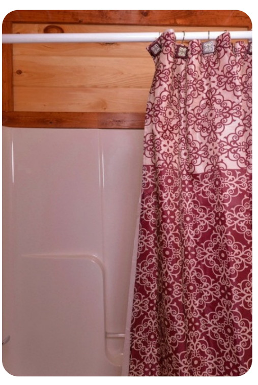
Pigeon Forge 37 | Page 8 of 8