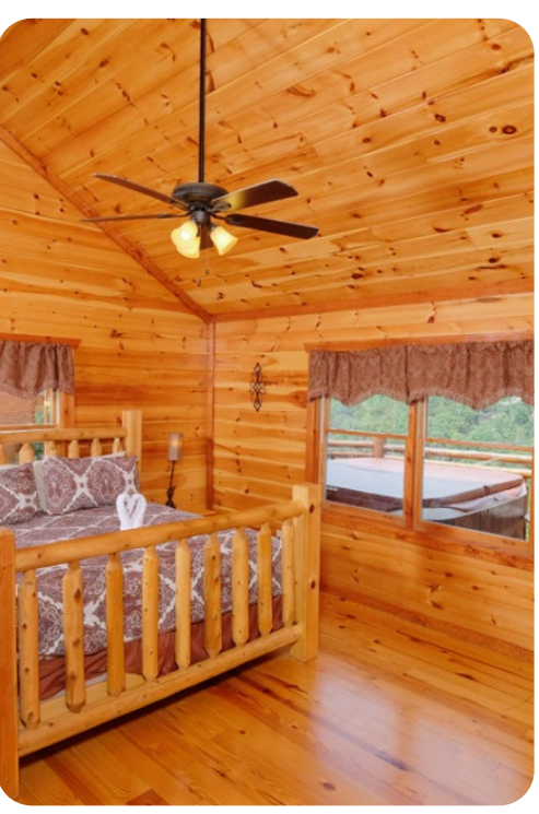
Pigeon Forge 37 | Page 6 of 8