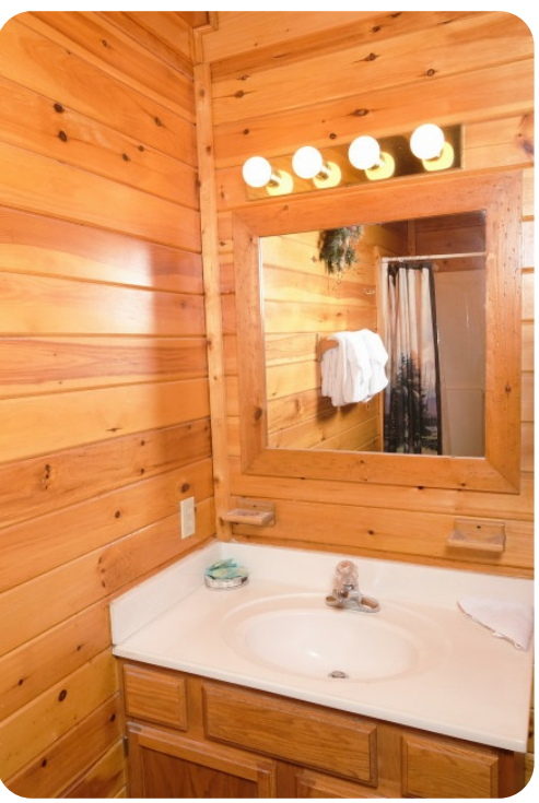
Pigeon Forge 36 | Page 7 of 8