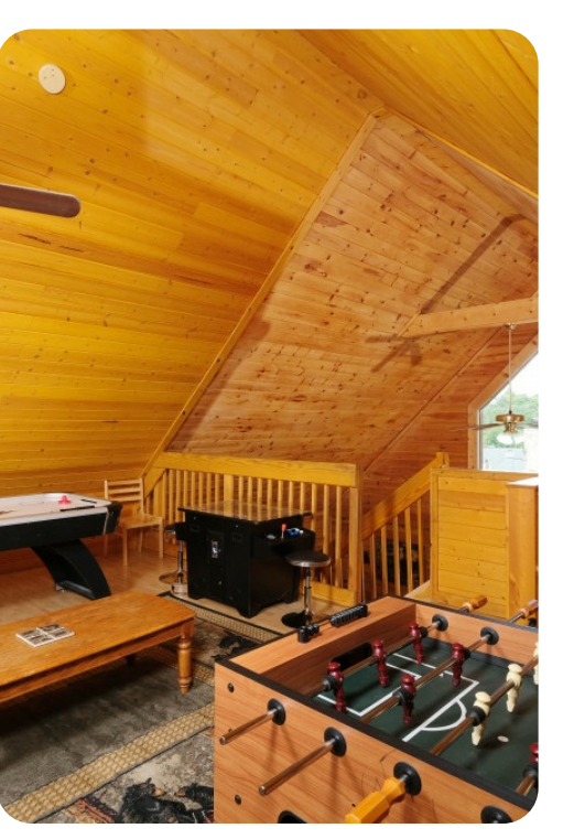
Pigeon Forge 36 | Page 5 of 8