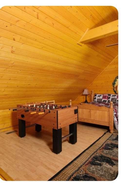
Pigeon Forge 36 | Page 4 of 8