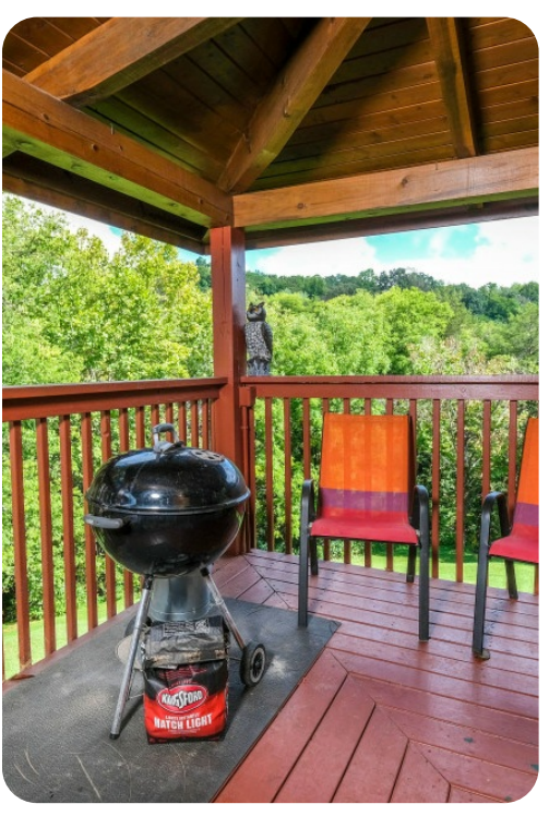
Pigeon Forge 36 | Page 8 of 8