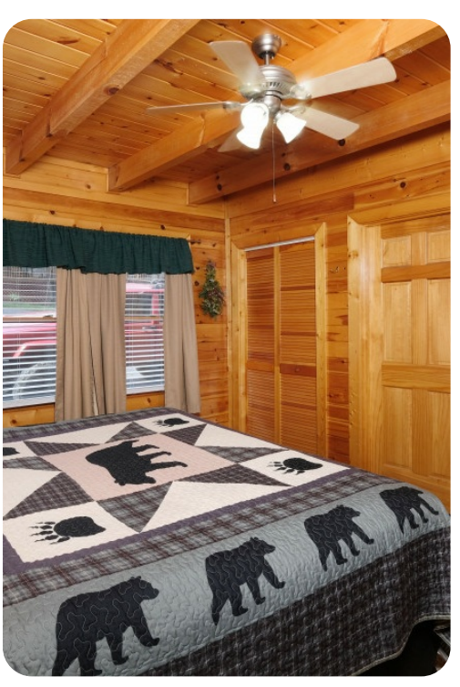
Pigeon Forge 36 | Page 6 of 8