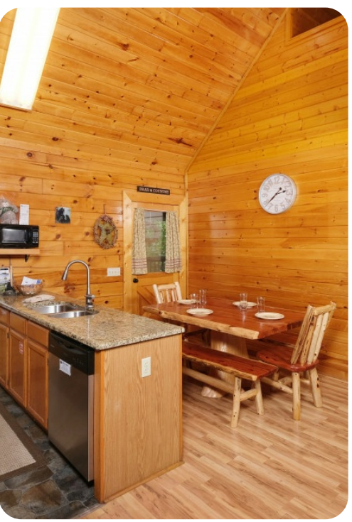
Pigeon Forge 36 | Page 3 of 8