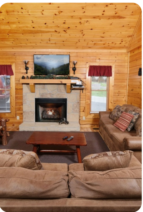
Pigeon Forge 36 | Page 2 of 8