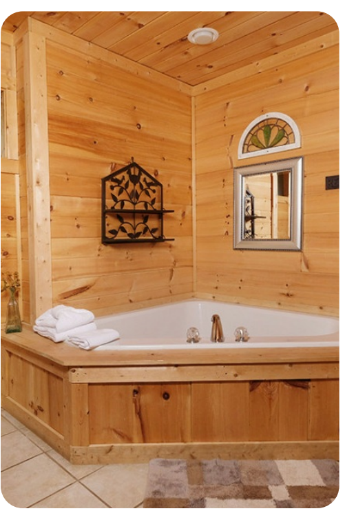
Pigeon Forge 21 | Page 5 of 8