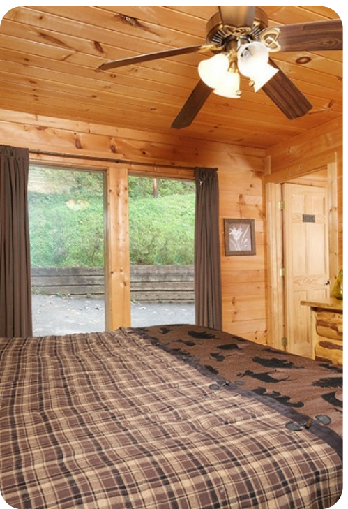
Pigeon Forge 21 | Page 6 of 8