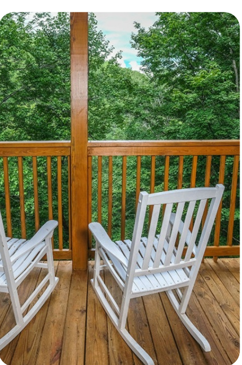
Pigeon Forge 21 | Page 8 of 8