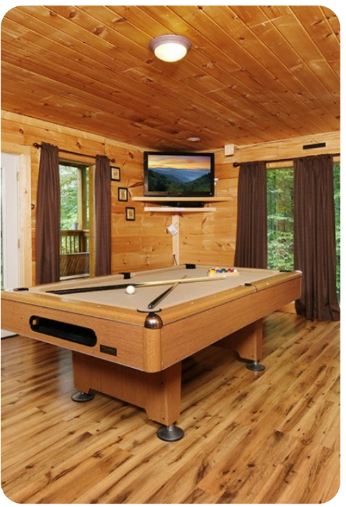
Pigeon Forge 21 | Page 4 of 8