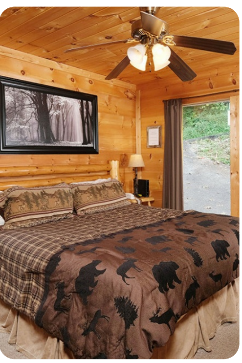
Pigeon Forge 21 | Page 3 of 8