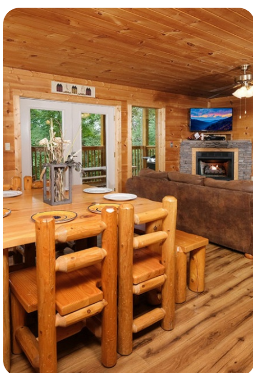
Pigeon Forge 21 | Page 2 of 8