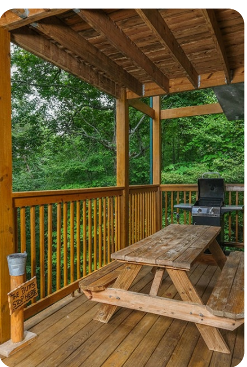
Pigeon Forge 21 | Page 7 of 8