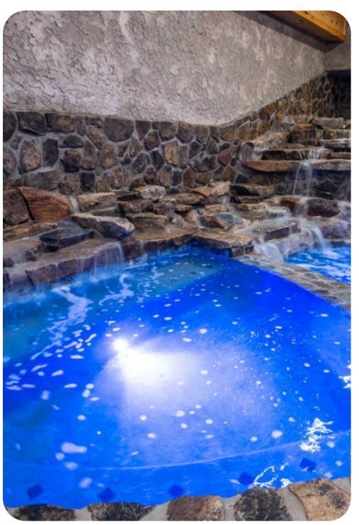
Pigeon Forge 16 | Page 6 of 8