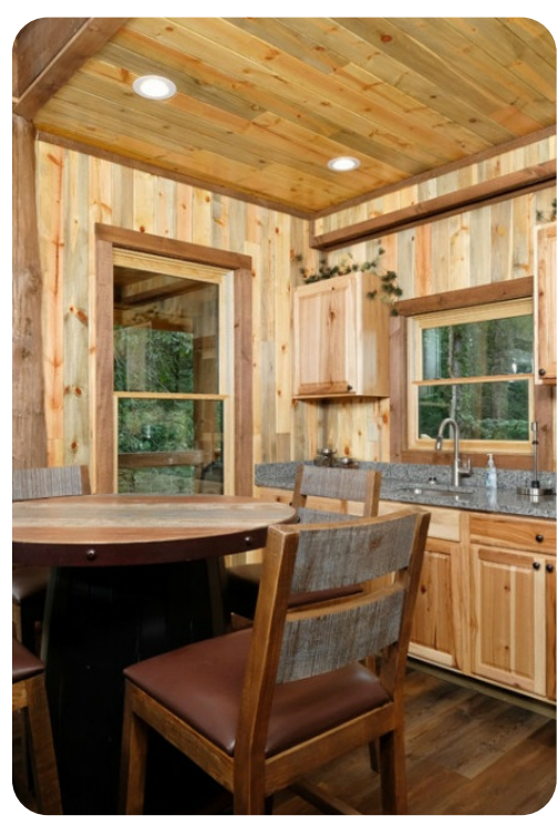
Pigeon Forge 16 | Page 3 of 8