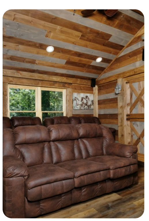
Pigeon Forge 16 | Page 2 of 8