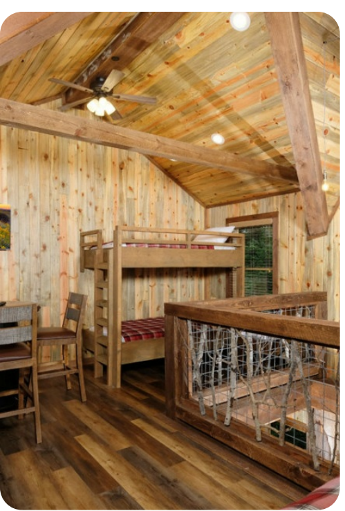
Pigeon Forge 16 | Page 4 of 8