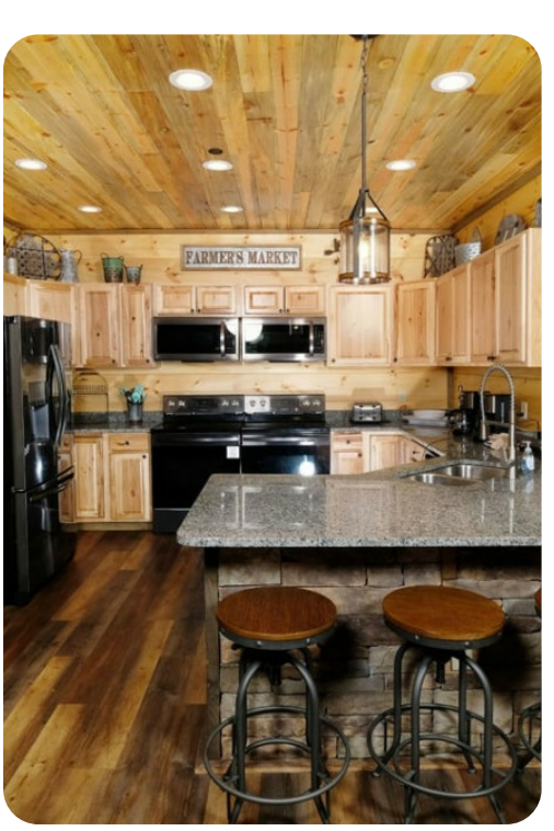
Pigeon Forge 16 | Page 5 of 8