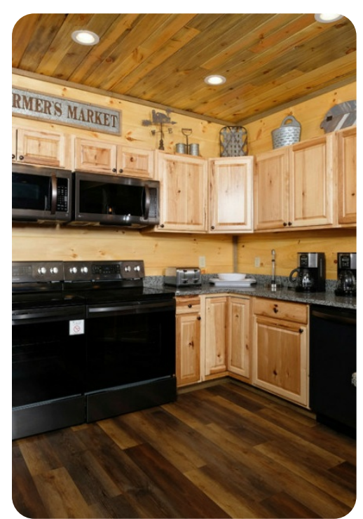
Pigeon Forge 16 | Page 7 of 8