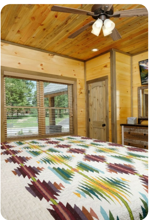
Pigeon Forge 16 | Page 8 of 8