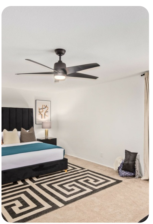
Phoenix 25 | Page 4 of 8