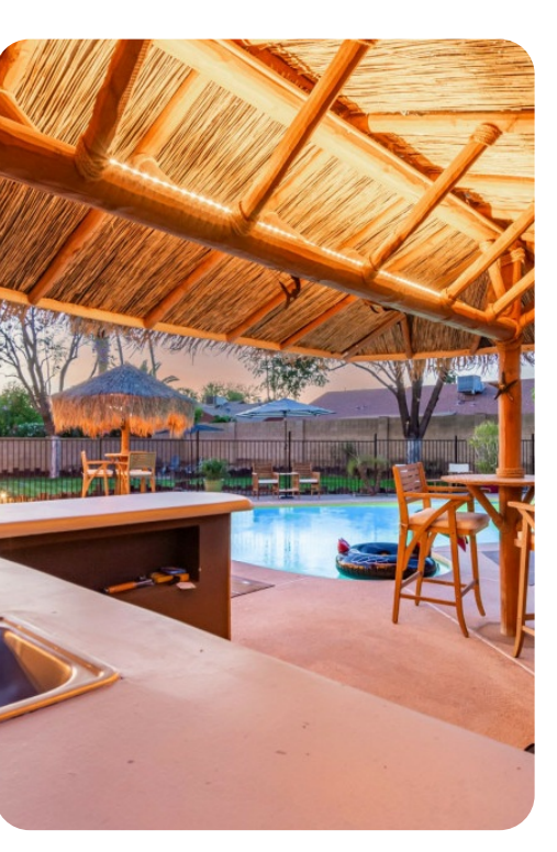
Phoenix 25 | Page 8 of 8