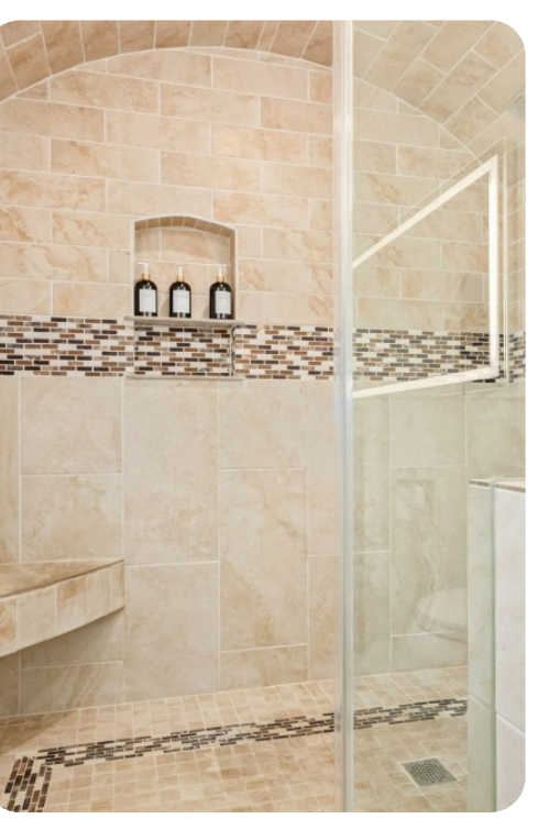
Phoenix 25 | Page 5 of 8