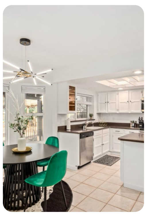
Phoenix 25 | Page 3 of 8