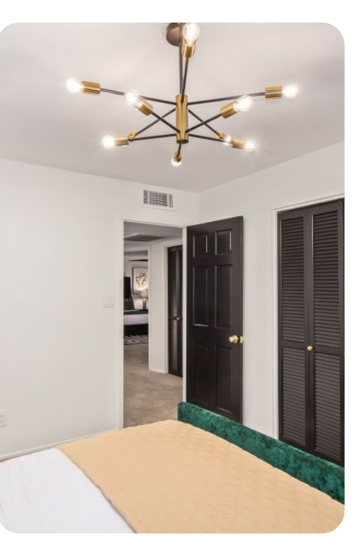
Phoenix 25 | Page 6 of 8