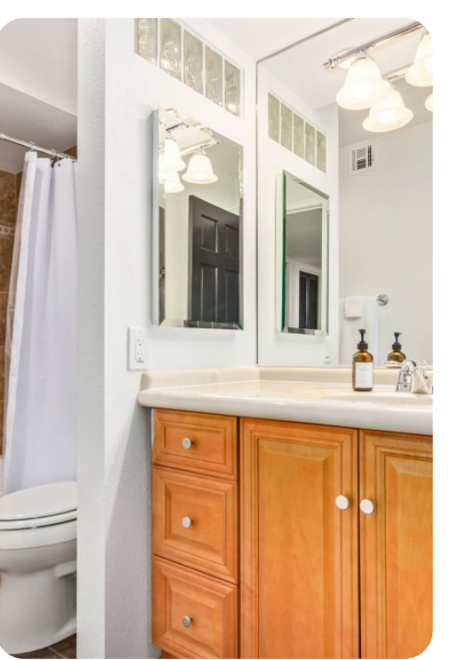
Phoenix 25 | Page 7 of 8