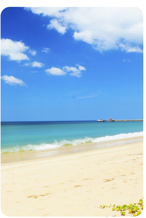
Phang Nga 6416 | Page 3 of 6