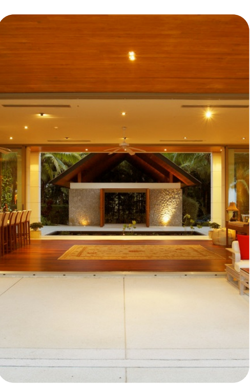
Phang Nga 6416 | Page 2 of 6