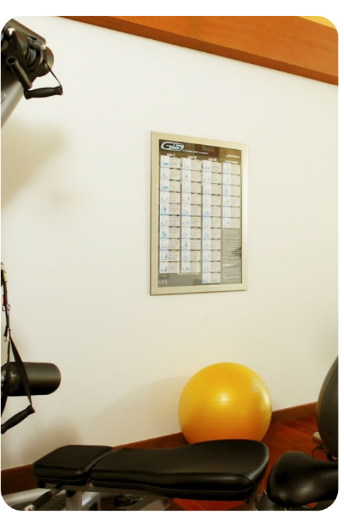
Phang Nga 6416 | Page 4 of 6