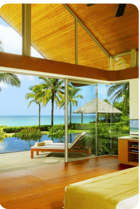
Phang Nga 6416 | Page 5 of 6