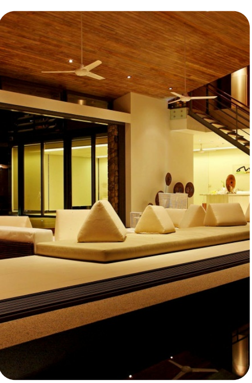
Phang Nga 6407 | Page 8 of 8