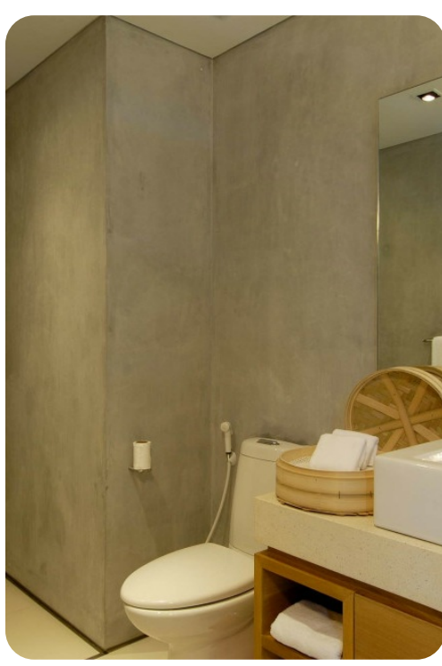
Phang Nga 6407 | Page 2 of 8