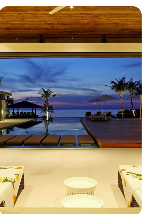
Phang Nga 6407 | Page 4 of 8