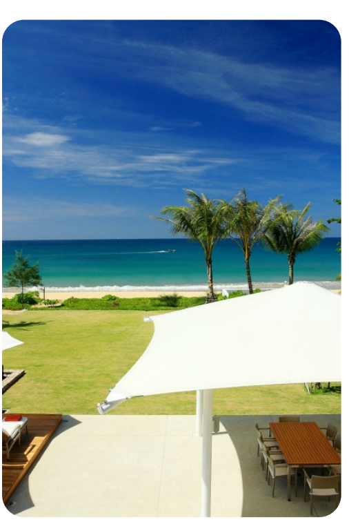
Phang Nga 6407 | Page 3 of 8