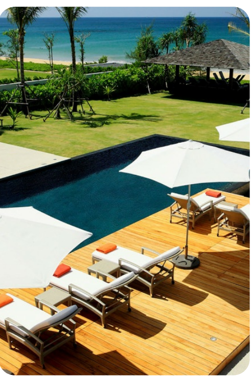
Phang Nga 6407 | Page 7 of 8