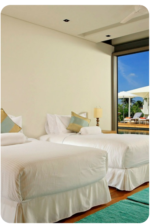
Phang Nga 6407 | Page 5 of 8