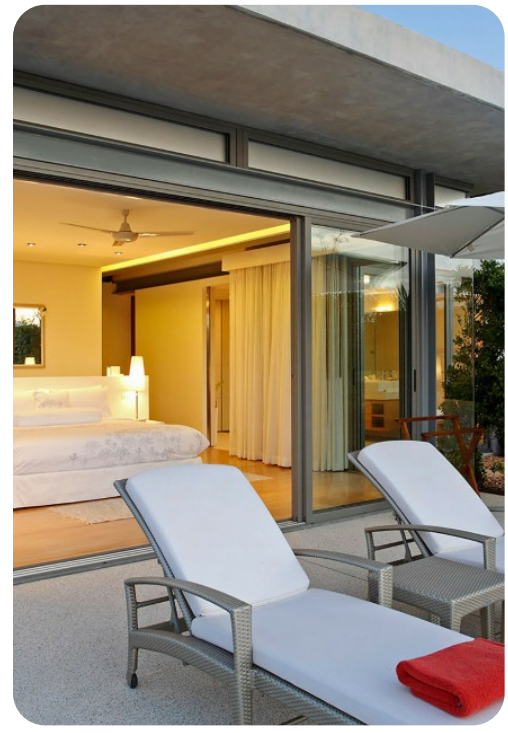
Phang Nga 6407 | Page 6 of 8